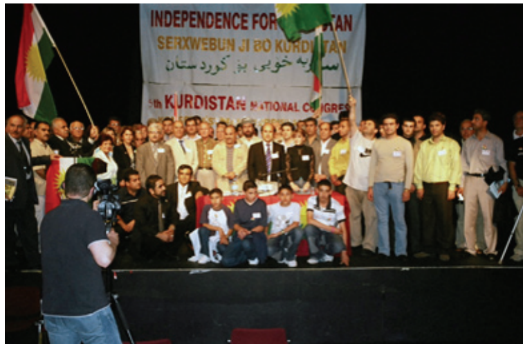
The 5 th Kurdistan National Congress-London 30 th July 2005