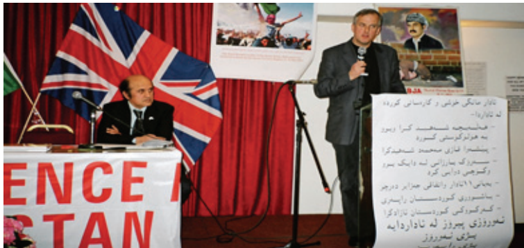
Kurdistan Flag and Kurdish traditional cloth.