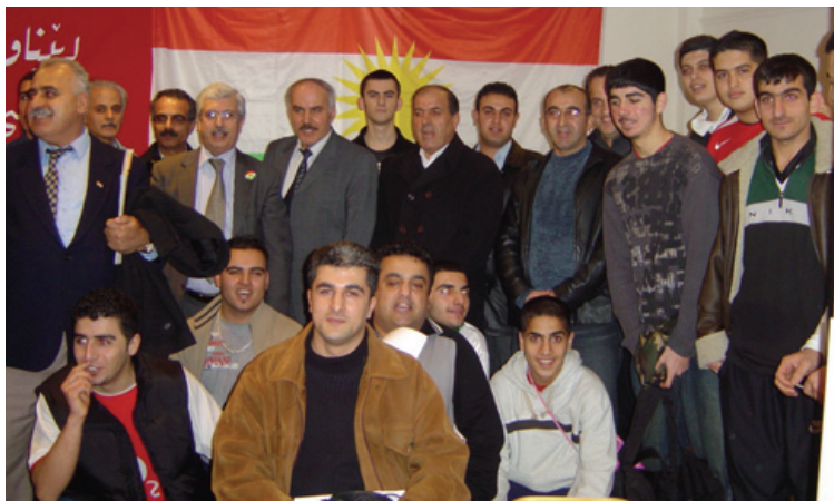
Meeting of the Referendum High Committee for Independence for Kurdistan in London