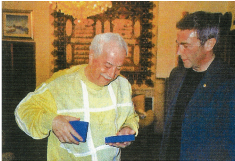
The new Nazis leader Jorg Haider had a trip to the Middle East, but he met only Saddam Husein, Udai Saddam Husein and Mustafa Tilas the Syrian former defence minister as shown in the photos above.