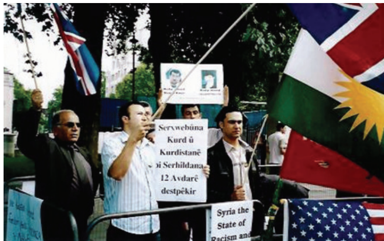
Our Kurdish demonstrations in London always had the banners against terrorism and to support Independent of Kurdistan and raised the American, Kurdistan, British flags