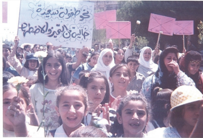
The Kurdish children demonstration in Damascus in 25 June 2003