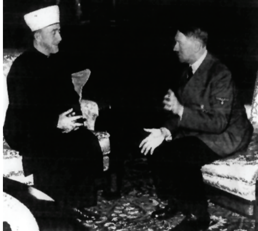
Adolph Hitler with Sheikh Amin Al-Huseini of Jerusalem