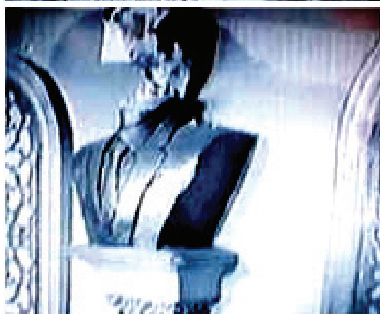
destroying statues of Hafiz Assad