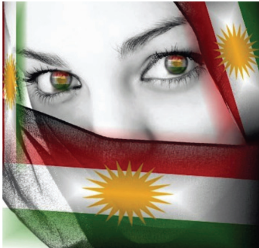
Kurdish girl covers her self with Kurdistan flag in Western Kurdistan