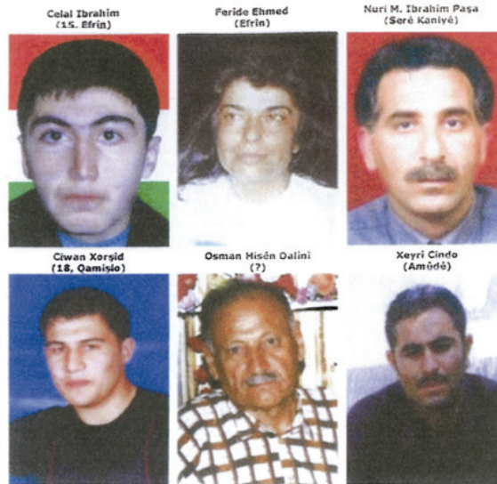
Pictures of some Kurds ages 15-70 years old been shot in the streets of Kurdish cities in western Kurdistan by the Syrian regime on 12-13 March 2004