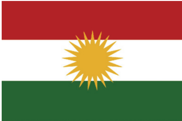
Kurdistan National Flag