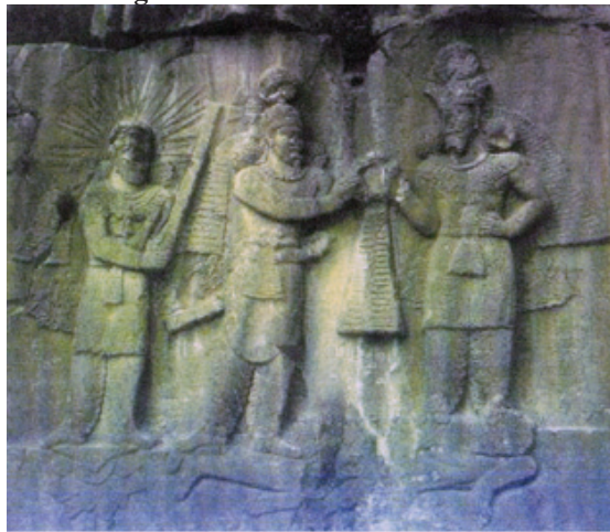
From the right the Zoroastrians God, Ahoramizda gave the ring of power to the Kurdish King Ardasher II, and Mitra, God of the Sun watching the ceremony, 24 centuries ago, in East of Kurdistan.