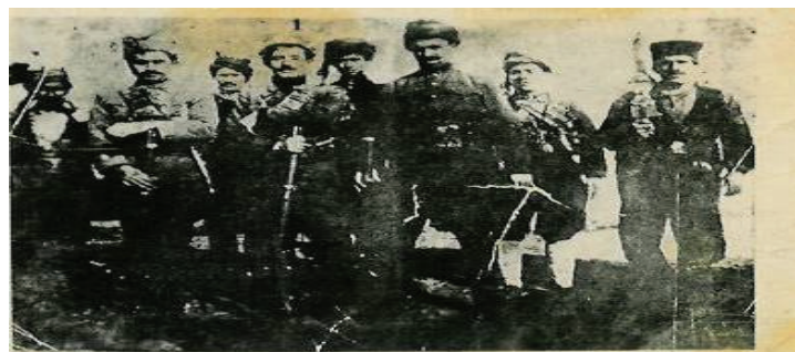
General Ihsan Nouri Pasha, leader of Northern Kurdistan revolution 1927-1930