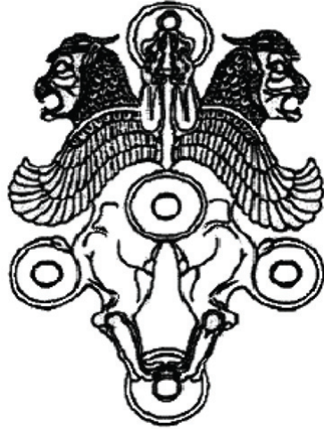
The Kurdish Empire Emblem 700BC