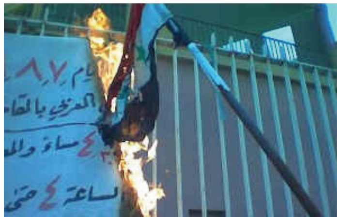
The Kurdish people in Syria burned the Syrian Flag and destroyed the statues of Hafiz Assad the father of the Syrian dictator Bashar Al-Assad, in the Kurdish cities during the Kurdish