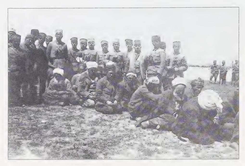
16. Shaykh Sa'id and his collaborators captured by the commanders of the 12th division of the Turkish army, and Isma'il Hakki Beg, the governor of Genc (standing behind wearing a fez).

be known. According to Kurdish sources, civilian losses amounted to 206 villages destroyed; 8,758 houses burned; and 15,206 men, women, and children killed. Two years after the rebellion Sureya Bedir Khan alleged that one million Kurds were murdered or deported. Five years later, Chirguh, in contrast, maintained that more than 500,000 were deported during the winters of 1925–26, 1926–27, and 1927–28, and that more than 200,000 of these deportees lost their lives in the course of their forcible removal to western Anatolia. These same sources claimed that the Kurds suffered 2,400 battle casualties in killed and wounded, and the Turks suffered 50,000 in killed and wounded. The campaign is said to have cost the Turkish treasury 60 million Turkish pounds.