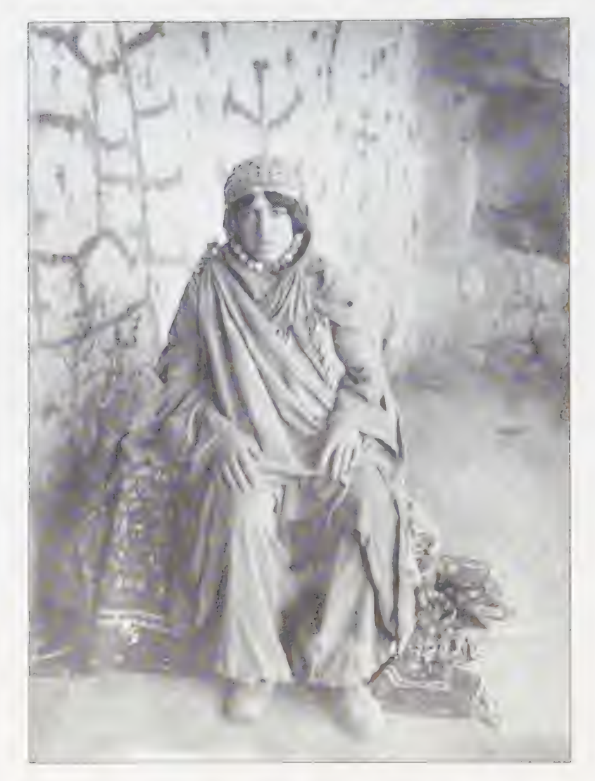
7. Kurdish woman.

Kurdish woman is chaste. Prostitution is unknown among the Kurds; in fact, many writers have noted that there is no word for "prostitute" in the Kurdish language. <sup>113</sup> In the severely puritanical atmosphere of Kurdistan, death is the usual punishment for any breach of the moral code. <sup>114</sup>