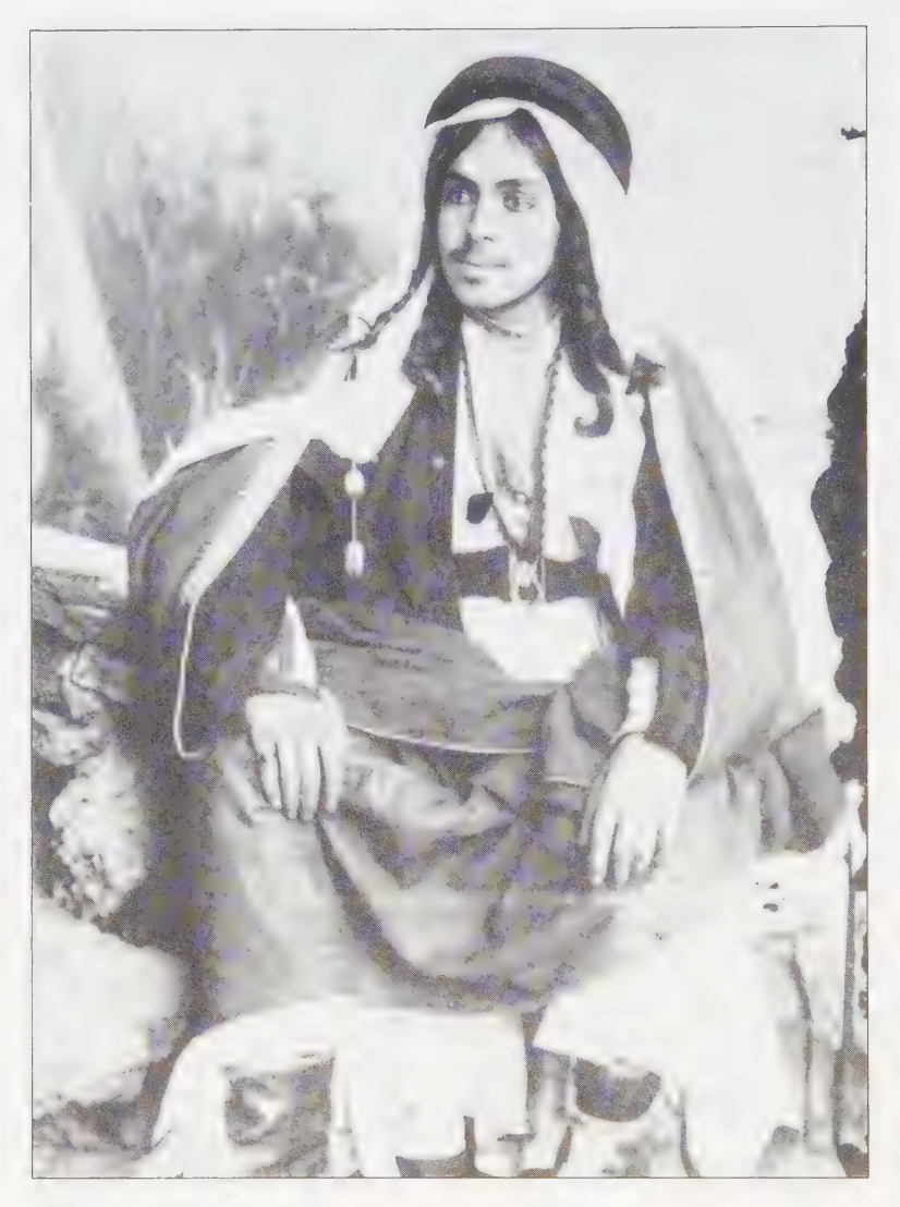
3. A Yazidi agha. From the Jebel Sinjar, circa 1935. From The Yezidis: A Study in Survival, 1987. Kegan Paul: London and New York.