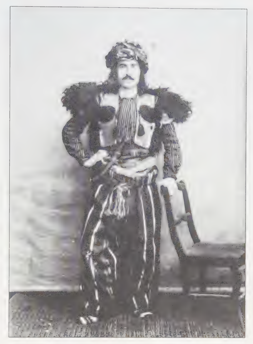
8. A Kurd from the Hawraman area in native dress. Only the members of one Christian family in Kurdistan continue to make the type of handwoven pants worn by this Kurd.