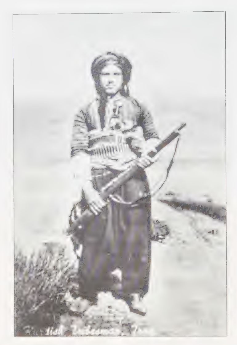
13. A typical Kurd, Iraq. Postcard, Iraq, circa 1960. Kurdistan: In the Shadow of History.

British commander in chief instructed him to comb the entire countryside with the object of punishing the rebels and asserting the now badly shaken British authority.<sup>18</sup>