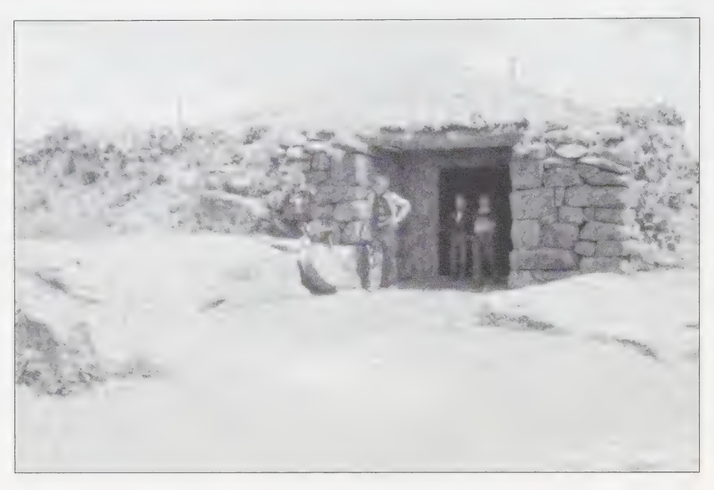
6. An underground dwelling in the village of Mox in the province of Mush (Turkey).

Meat is rarely eaten except by the wealthier Kurds. <sup>89</sup> Lamb is preferred, but goat's meat, beef, and poultry are also consumed. The Kurds eagerly seek game, such as gazelle in the plains and ibex and mountain sheep in the hill regions, and game birds, such as duck, partridge, quail, and sand grouse. <sup>90</sup> Many areas in Kurdistan abound with wild boar. Because Muslims, Yazidis, and Ahli Haqq are forbidden by their religion to eat pork, the presumption is that the Kurds do not eat this food. However, various reports indicate that members of all three groups occasionally violate this prohibition. <sup>91</sup>