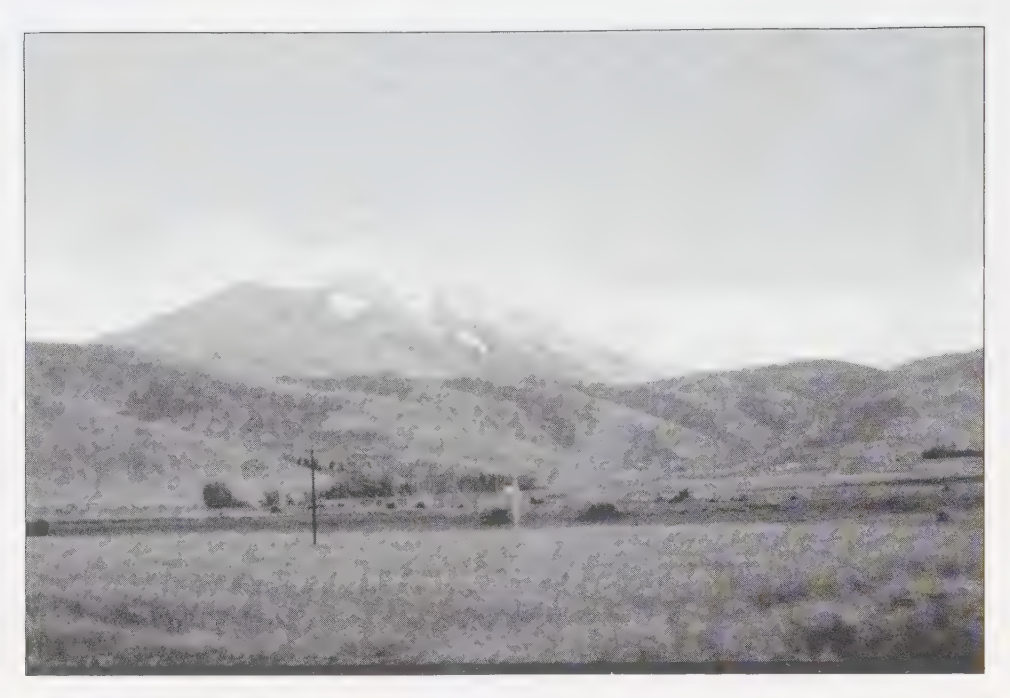
2. Mountains near the Kurdish province of Van (Turkey).

temperature below 15 degrees Fahrenheit. The temperature has been known to fall below –17 degrees Fahrenheit every night for three weeks. Absolute minimums of –30 degrees have been recorded, and on the higher plateaus such figures as –40 degrees Fahrenheit are not unknown. Another extremely cold area is the Norduz basin, south of Lake Van, which in winter is practically abandoned. Summers are hot and arid, particularly toward the north and east. Maximum summer temperatures exceed 100 degrees Fahrenheit and often rise as high as 110 and 120 degrees in certain valleys. <sup>15</sup>