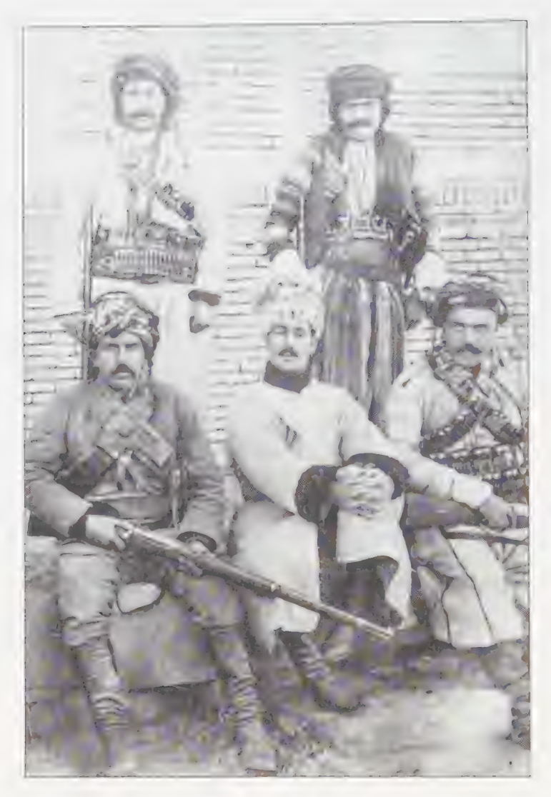
12. Simko in Sulaymaniya. Kurdistan: In the Shadow of History.

tribe, who had fled into Persian territory when hard pressed by hostile members of his tribe.<sup>54</sup>