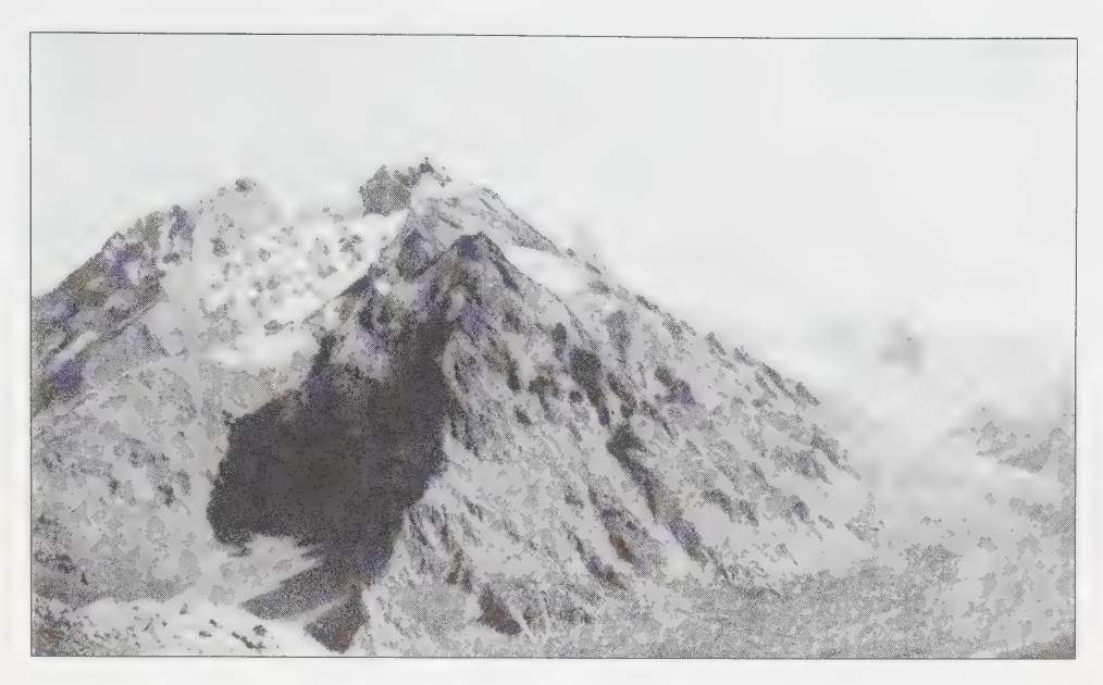
1. The Kurdish Frontier Mountains, Iraq. From E. B. Soane, To Mesopotamia and Kurdistan in Disguise .

ments along well-marked faults." <sup>9</sup> He points out that horst blocks and downthrown basins are characteristic of this area, although in many cases their outlines have been modified by intense erosion. <sup>10</sup> In the central Zagros, the situation is different. Folding rather than faulting is the pattern. Numerous deep gorges, known locally as tangs , cut across these mountains, as a result of which drainage follows an intricate pattern. <sup>11</sup>