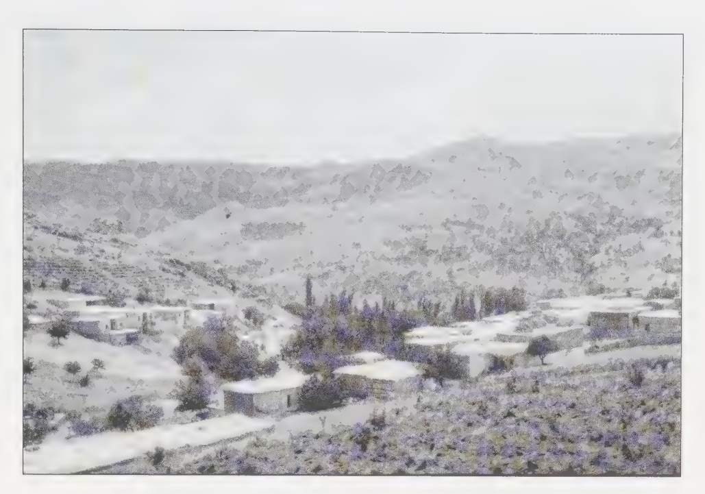
5. A Kurdish village in Adiyaman (Turkey) showing typical Kurdish flat-roofed dwellings.

Kurdistan, particularly in the Dersim highlands <sup>82</sup> and in parts of the Hakari highlands, <sup>83</sup> houses are reported to be built of stone and plaster and are fairly sturdy.