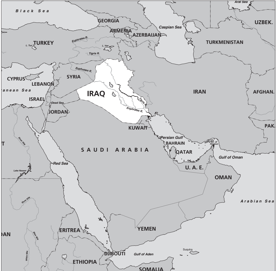
Map 1.1 Iraq in the Middle East