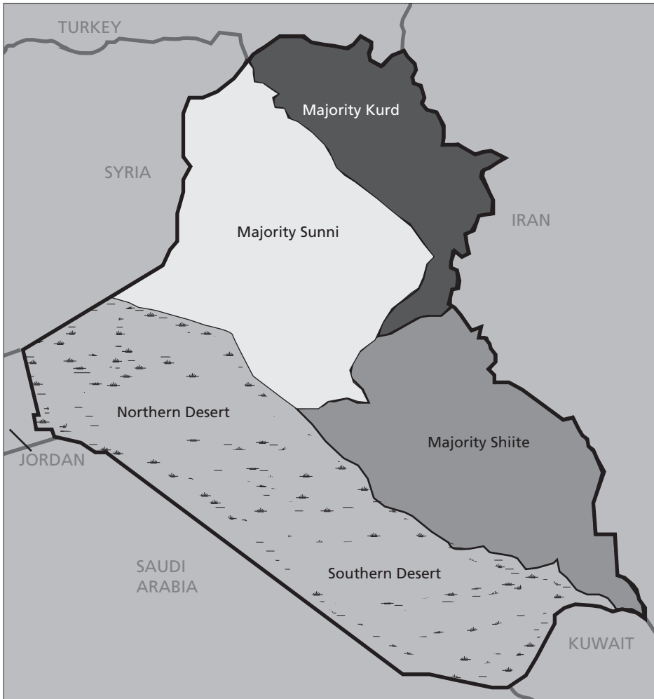
Map 1.3 Iraq's Major Ethnoreligious Groups