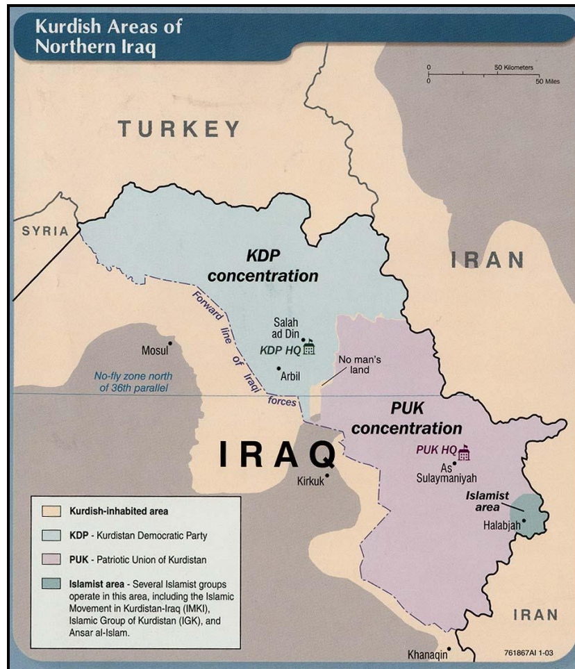
Figure 1: Internal Political Division of Iraqi Kurdistan