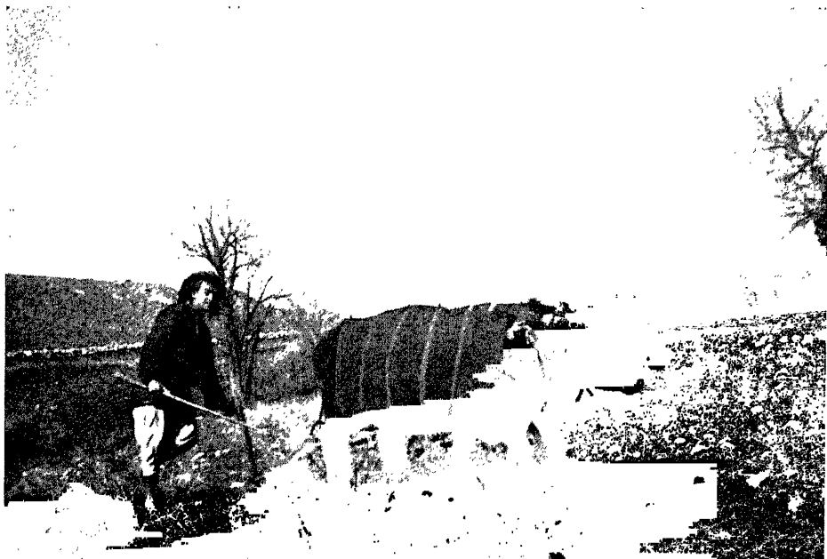
Namiq ploughing ( see WAR. 189)