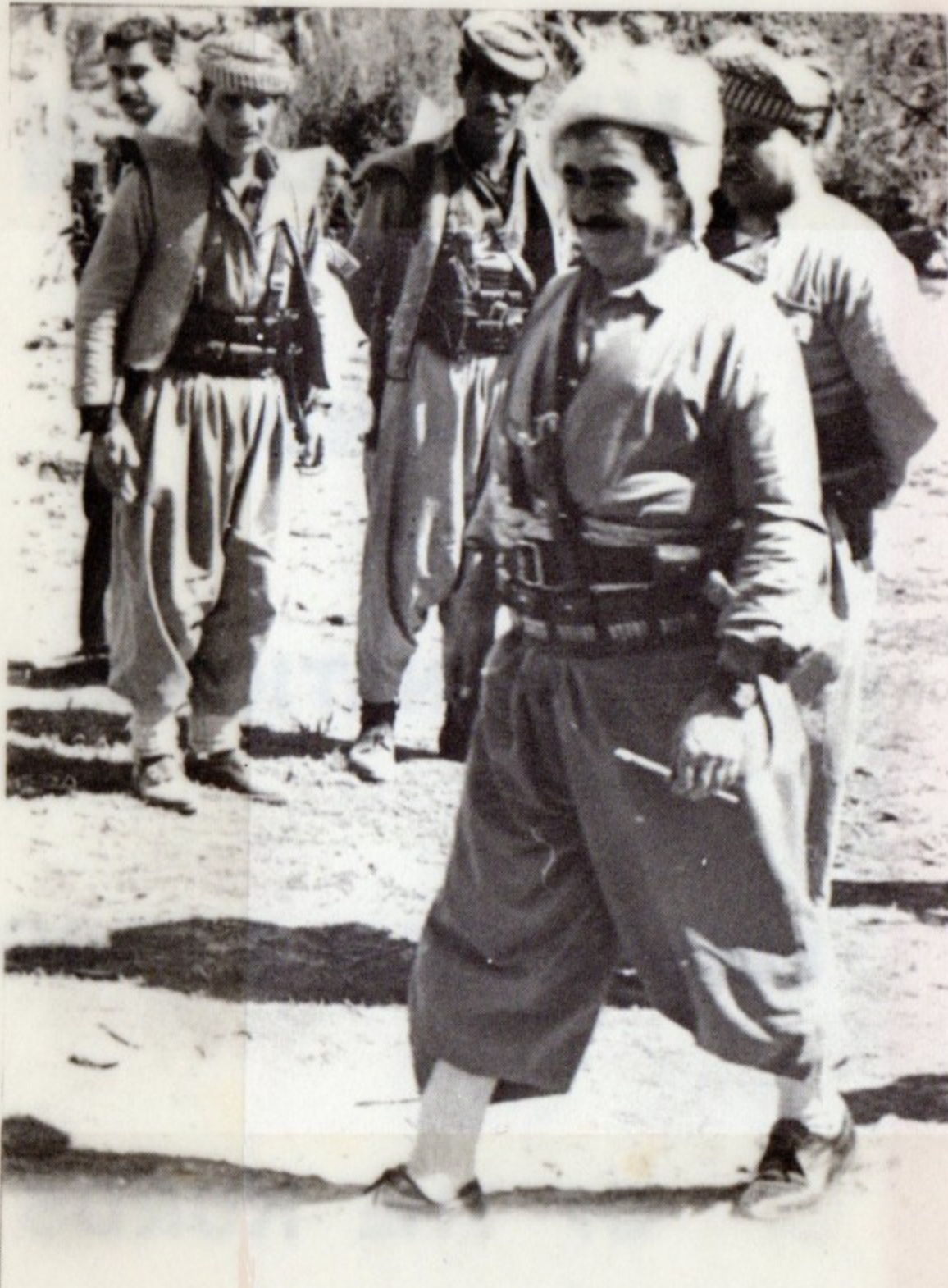
General M. BARZANI, leader for the Kurdish National Liberation struggle.

Our organisation is a progressive revolutionary Political Organisation consisting of Kurdish peasants, workers and intellectuals inside and outside of our country.