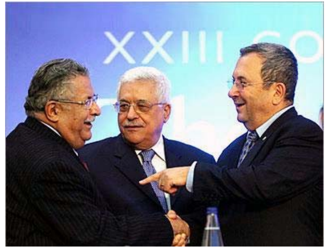
Jalal Talabani (left), Iraqi president and head of the Patriotic Union of Kurdistan, did not hesitate to shake hands publicly with Israeli defense minister Ehud Barak (right) at a conference in Greece, April 2008, as Palestinian Authority president Mahmoud Abbas looked on. When denounced by members of the Iraqi parliament, Talabani emphasized that the handshake was in his capacity as head of the PUK and not as president of Iraq.

Relations with the PKK were also a reflection of Israel’s relations with the West in general and Turkey in particular. Following on the footsteps of Western countries, Israel had to take Turkish sensibilities into consideration; Ankara regarded the PKK as a deadly enemy. Jerusalem felt obliged to keep its distance from Kurdish leaders in Turkey, certainly the PKK, so as not to antagonize the Turks and jeopardize their special ties. It should be noted that Israel’s strategic relations with Turkey, which reached their peak in the mid-1990s, coincided with the lowest point of relations between Ankara and the PKK, then engaged in a fierce civil war. 32 Yet for all the Turkish pressure, Jerusalem was long reluctant to denounce Kurdish terrorism. For example, during his visit to Israel in 1993, Turkey’s foreign minister Ahmet Çetin raised this demand, but his hosts refused to comply. 33 In May 1997, however, at the height of the Turkish-Israeli relations, Prime Minister Benjamin Netanyahu reportedly declared Israel’s support for Turkey in its conflict with the PKK. Netanyahu went further and asserted there would be no peace with Damascus unless it ended its support for