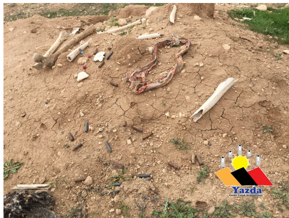
Unprotected mass grave in the north side of Sinjar.

Yazda, together with advocate Nadia Murad and other Yazidi survivors, have worked tirelessly to ensure this recognition, which has two important consequences. First, it acknowledges the gravity of the offenses perpetrated against the Yazidis. Genocide is indeed considered to be ‘the crime of crimes’. 15 Second, states are under an international legal obligation to prevent and punish acts of genocide. 16 The international community failed to prevent the genocide against the Yazidis in 2014; it continues to have a duty to punish those responsible. Recognition of the Yazidi genocide therefore represents a step towards holding IS accountable for its heinous crimes in a suitable judicial forum. The genocide continues to this day, and will continue until all captives are liberated and IDPs are able to return home.