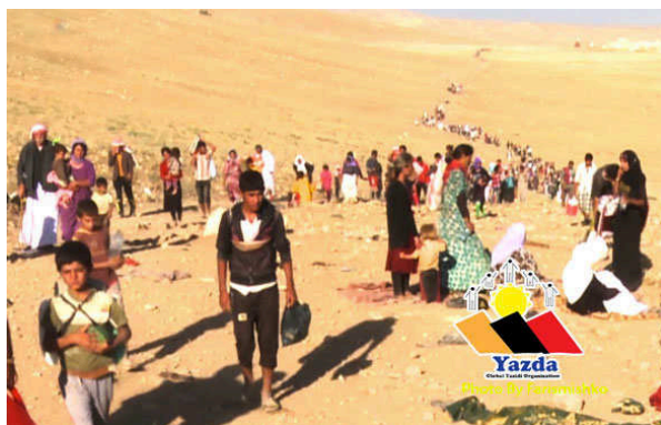
Yazidis fleeing toward Mount Sinjar 3rd August, 2014.

IS's attack also caused an estimated 250,000 Yazidis to flee to Mount Sinjar, where they were surrounded by IS for days in temperatures above 40 degrees Celsius. IS prevented any access to food, water or medical care in a deliberate attempt to cause large numbers of deaths. Hundreds of Yazidis perished before a coordinated rescue operation involving Yazidi volunteer defenders, the Syrian Kurdish forces (YPG) and Kurdistan Workers Party (PKK), along with an international coalition led by the United States, led to the opening of a safe passage from Mount Sinjar to Syria from 7 to 13 August 2014.