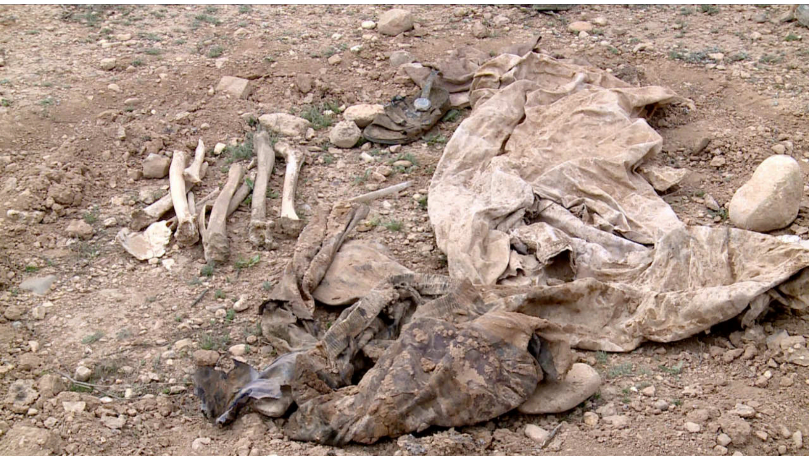
Remains of Yazidi victims at a Mass grave in Sinjar.