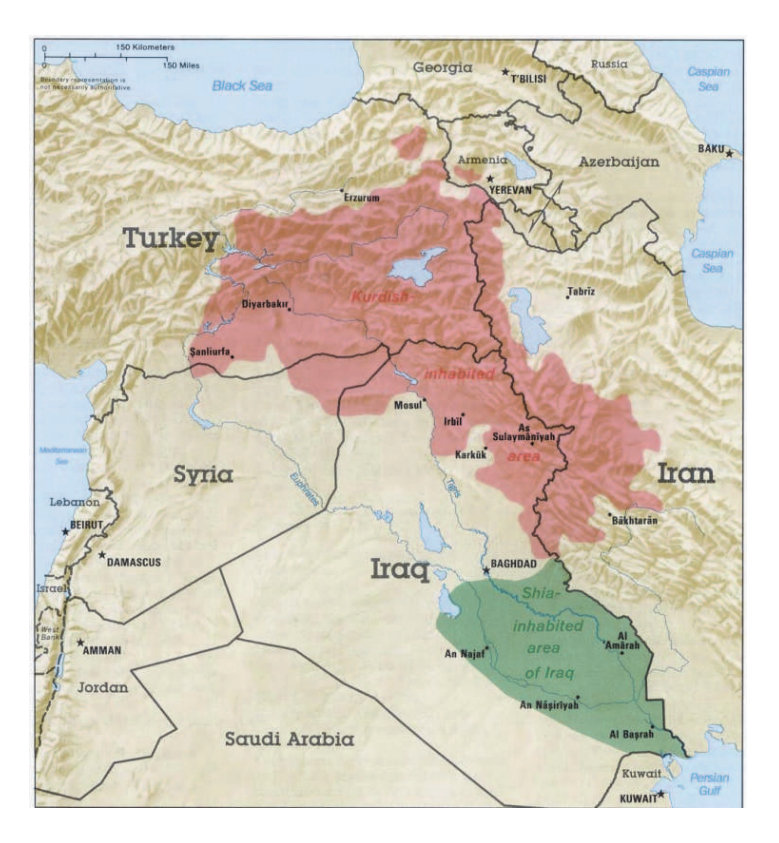
Map 1. The Kurdish-inhabited area.

Turkey, and Syria, along with smaller territories in western and central Asia. The Kurdish-speaking populations reside in quite extensive areas of eastern Turkey. northern Iraq. western Iran, and northern Syria (see Map 1). The Kurds form the fourth largest ethnic group in the region after Arabs, Persians, and Turks, consequently constituting rather sizeable ethnic and linguistic minorities within these four states The estimated number of Kurds varies between 25 and 30 million (Hassanpour & Mojab