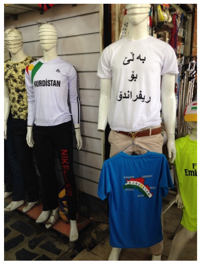
Figure 24 - "[Yes to the Referendum]."

On Friday, September 23, the sermon was upbeat, patriotic, and extremely careful not to frame their support for the democratic process in sectarian terms. No one and no groups were named. Granted, they didn't need to be, but I was extremely appreciative all the same.