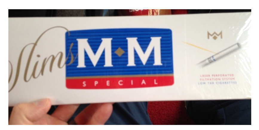
Figure 35 - the cargo: Turkish cigarettes

As I continued to wait, I had time to buy a drink and extend my walkabout to do some harmless eavesdropping. Most of the time they were on their phones or talking with other drivers arranging passengers, and after fifteen minutes we filled up. Unlike last trip, I was the only real 'passenger,' as the others all seemed to be part of the van team. Each of them brought several large bags filled with cigarette boxes. Cartons and cartons of cigarettes.