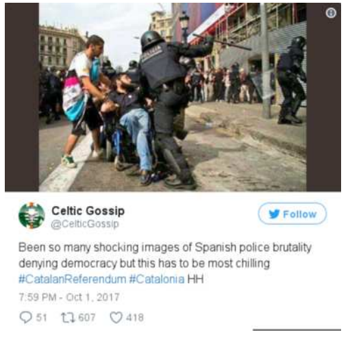
Figure 2 - Tweet from October 1, 2017 regarding the Catalonian referendum

that the beatification ceremony was an act of imagined nostalgia, bleaching the past of moral nuances.