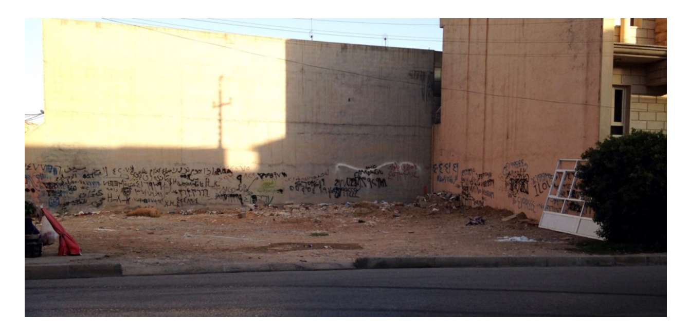
Figure 18 - Erbil "White Pages"

The second is the concept of wastā ; in and of itself, means 'conductor' or 'foreman,' but in practice means patron, 'inside man,' or any other entry point to a desired good or service based on personal relationships. For instance, if someone wants to get a particularly difficult license, most find the right ministry building then go to wait, plead, and pay various fees as they make their way through the multitudinous layers of Kafka's castle to get there. Or, if you've got a good wastā , the intermediary could simply walk their friend straight to the correct office where they have a brief conversation with their own connection, then fees are paid and the license is granted. This extends to almost every aspect of life in Iraqi Kurdistan.