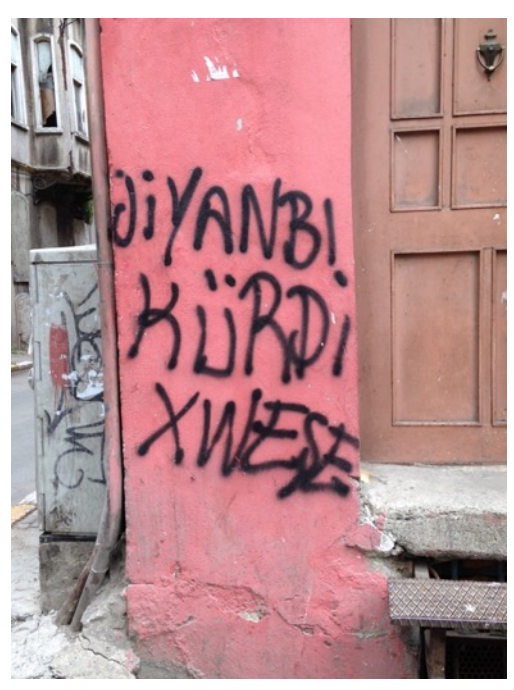
Figure 7 – Right: in Kurmanji it should be written "Jîyan bi Kurdî xweş e." Second, I've also had a friend say that the best way to translate it would be something like, "Life is good when you are a Kurd and live in a Kurdish culture." Left: street tags for the PKK and one of its offshoots, YDG-H

The Passport Stamp & Introduction to the Great Struggle Against the Bureaucratic "Nobody"