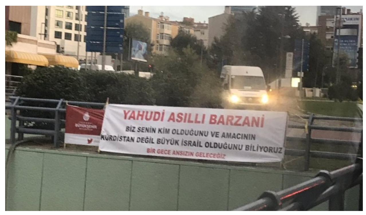
Figure 23 – This is a banner placed in downtown Istanbul in September 2017 before the Kurdish referendum. It reads,"[Barzani is of Jewish Origin; we know who you are and your purpose is not Kurdistan [it is] Greater Israel; one night we will suddenly come"

Applying our primary lens of for viewing Kurdish politics in light of existing Islamic societies, there are two main points this reveals about the 2017 Referendum. While the personalized Barzani-Referendum connection was not used to market the idea outside of Kurdistan, it was fairly obvious even if you weren't surrounded by the merchandising. Therefore, casting the Barzanis as crypto-Jews goes beyond any simple political dismissal of the Referendum. It would have been an equally easy sell to write the whole thing off as Barzani self-interest. Marking them as Jews pretending to be Muslims makes them the worst kind of enemy – the one that attacks