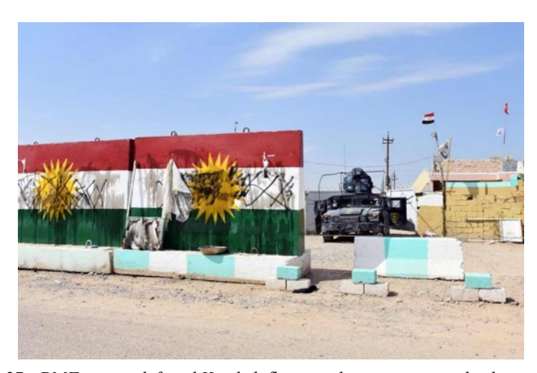
Figure 27 - PMF troops defaced Kurdish flags on their way up north; this picture was taken in Tuz Khurmatu on October 13, 2017; source: Ibrahim, 2017.

If you connected them, it quickly became apparent that all of the major roads were being cut off, and Erbil was being boxed in.