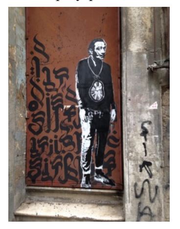
Figure 6 - Istanbul graffiti

Salvador Dali wearing a massive watch on a chain two blocks south of my apartment; there is a definite sense of care and thought to the spray-painted walls.