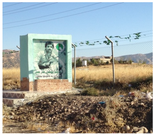
Figure 13 - top left: painting of Peshmerga in downtown Erbil; top-right: picture of a PUK martyr posted 100m from a PUK checkpoint; bottom-left and right: Peshmerga bazaar in Erbil