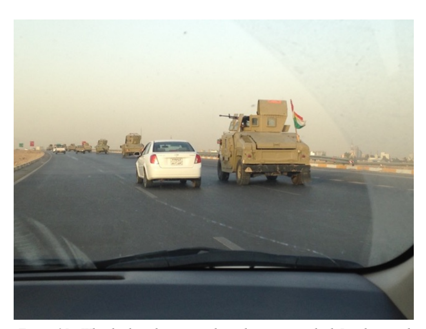
Figure 25 - What bothered me most about this picture, which I took several days before the siege of Kirkuk, was the fact that they weren't going south—where we expected them to go; rather, they were going northeast, as were a large number of other air and ground military transports

The host thanked me, and I was shuffled off, de-microphoned, and kindly escorted back to the front entrance.