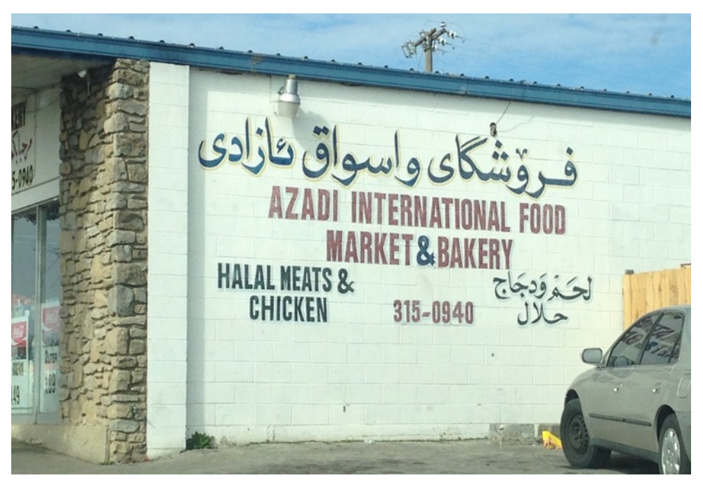
Figure 3 - Azadi International Food Market, Nashville, TN, adjacent to the Salahadeen Islamic Center

In short, the post-MLK Jr. American Dream portrays it as many Americans desire it to be – inclusivity with no regard for race, gender, or religion; the post-9/11 American Dream is one tinged by negative perceptions and fears that create political realities where there is much more debate on issues of trust that revolve around identity. It is within these contexts that I approached my research at the Salahadeen Islamic Center in Nashville, Tennessee.