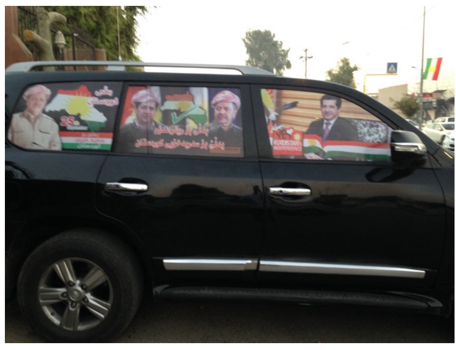
Figure 21 – above: vehicle I encountered in Erbil prior to the election; the front window was also covered in similar graphics; below: an advertisement for the Referendum in Sorani Kurdish, Arabic, and Turkmen