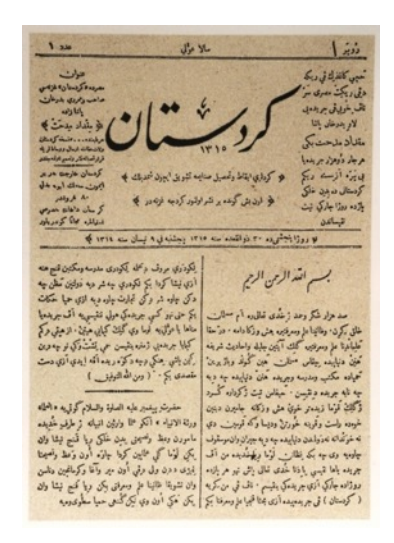
Figure 4 - The first issue of "Kurdistan" published in April, 1898 in Cairo, Egypt

exposed them to many elements that would have been unattainable to them in their original environs (Olson, 1989).