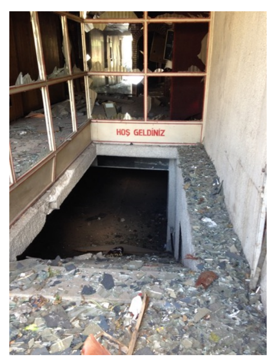
Figure 10 – A view into one of the affected buildings; Hoş Geldiniz - "Welcome"

Apparently, this attack came on the tail of some 400 people getting arrested on terrorism charges near Diyarbakir. It didn't take long to find out that the TAK, the Kurdish Freedom Hawks, was responsible.