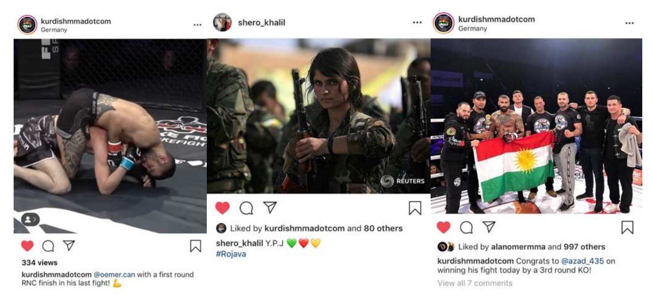
Figure 31 - Instagram, Twitter, Facebook, and other social media outlets provide Kurdish MMA fighters and Peshmerga devotees space to express their national pride

Four months in, I had substantially revised my hypopthesis. If I had to say what the national sport was in Iraqi Kurdistan, it would be the 'squat and smoke.' The men smoke small cigarettes and sheesha, they drink beers imported from Turkey, and they don't exercise; ironically, all three of these aspects are present when they get together to watch football (soccer) matches. I never met anyone that cited Peshmerga or other symbols of ethnic struggle as initiating them into martial arts.