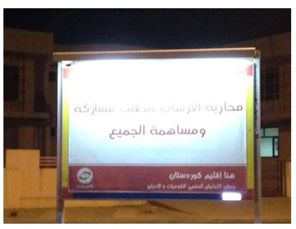
Figure 29 - "[Fighting terrorism requires the participation and cooperation of everyone]"

When it came to allocating blame for all on the turmoil, it frequently fell on the Arabs of