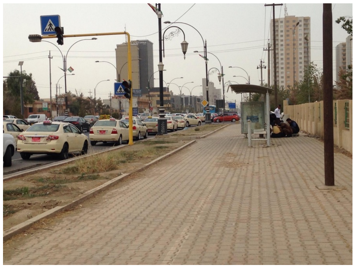
Figure 12 - Chronic, structural underemployment – a number of taxi drivers (their cars all parked on the right side of the road) pass the time waiting for fares to arrive by playing a game with stones and broken tiles. Incidentally, the small shelter they're playing next to is a bus stop.

What Samir's trainer was describing was simply one more price tag of the collective cost of endemic corruption and political feuding that gets passed on to the Kurdish populace.