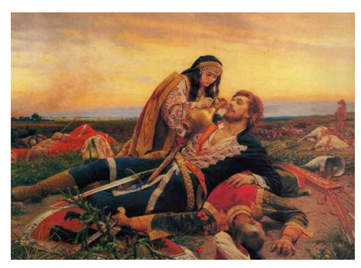
Figure 1 - Variants of "The Kosovo Maiden" painting were popular décor in Serbian homes before the war in 1992

This memory of Kosovo featured massively in the Serbian nationalist identity, and "imagined continuities" between modern Serbians and glorious 'Serbian' pasts were invented and used to transpose modern political strife onto an ancient and epic scale (Živković, 2011). Majstorovic called this process 'primordialization,' which applies not only to the enmities between (Christian) Serbs and (Muslim) Bosnians, but to the nature of the Serb ethnicity itself. On the relation between memory and identity, Richard N. Lebow (2008) made the observation that some "memories and commemorations may become inconvenient if they stand in the way of changing or reformulating identities," (p. 29). Massive swathes of accepted history and social science were swept aside to create the myths<sup>15</sup> that fueled the war. It was a folie à deux on a cultural level, purposefully manipulated on the part of Serbian political elites.