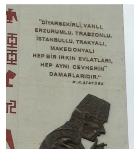
Figure 5 - "Those of Diyarbakir, Van, Erzurum, Trabzon, Istanbul, Thrace, Macedonia, All are of the same race, all are of the same core essence," M.K. Atatürk" – this adorns a wall bordering the central square of Diyarbakir.

Between the end of his rebellion and 1938, there would be eighteen uprisings against the Turkish government. All but one originated with Kurdish movements. For the Turks, the Sheikh Said Revolt was the most costly as the death toll may have been higher than that of the Turkish War for Independence (Taspinar, 2005: 80).