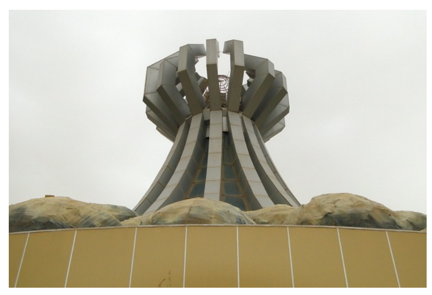
Figure 15 - A view from the bottom of the Halabja memorial complex

In 2003, the US military proposed a modernization project for Halabja's water system. The PUK convinced them to divert that money – some $20 million – from that the water project to erecting a memorial in Halabja. Furthermore, the monument is a bit of a hike from Halabja-proper, effectively divorcing the inhabitants from official uses, such as visits from dignitaries and other government leaders. On March 16, 2006, protestors – most if not all of whom were students from Halabja – pillaged and set fire to the monument. Simply put, they were expressing their extreme displeasure at the government having erected a sprawling memorial instead of meeting the basic human needs of the people. Clean water, electricity, and public services were absent from Halabja (Kakei, 2012). The protest resulted in the death of one student at the hands of security forces.