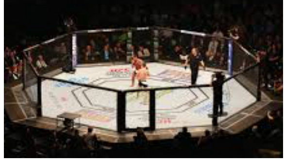
Figure 33 - (left) Da'ish 'octogon' where not one, but two pairs of fighters spar (Fightland Staff, 2015); (right) image from the UFC 210 Octogon in 2017 in Buffalo, New York (Graham, 2017)

Among the many recruitment videos issued by Dacish since its formation in Syria are several featuring martial-arts. Most of these are montage reels, the highlights of which include