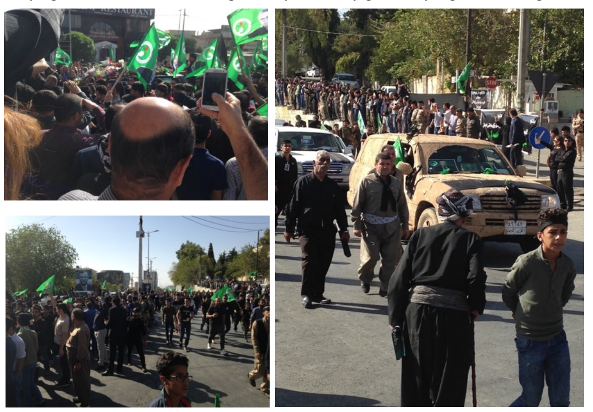
Figure 26 - pictures from Jalal Talabani's funeral procession

The morning of the funeral, I watched my small television in my small hotel as the plane carrying Mam Jalal's coffin accompanied by his family greeted by dignitaries and given military