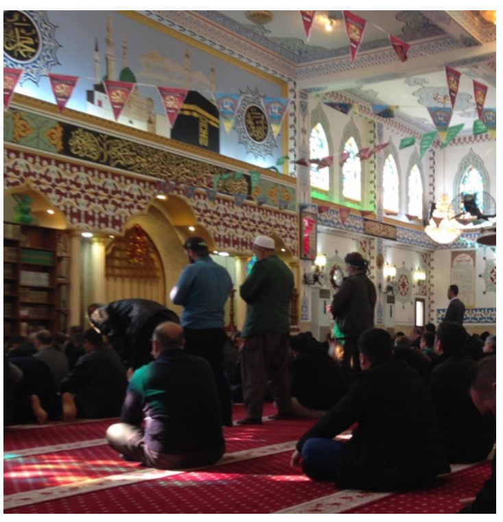
Figure 30 - two very different generations of Muslim Kurds engaged in prayer

This won me the ire and special attention of my neighbor, who made it his task to keep miming for me to do this or that thing, do not do this, do not do that. Being a little on the physically hung-over side of things (ten hours of intense training and sparring with my friends in a five-day span meant a lot of bruising and muscle soreness), I was tempted to tell him to bugger off, but even if I weren't in a mosque, that isn't something I can very well do. With one or two exceptions, Kurdish cursing is really all or nothing - don't say anything or leave no survivors. Honorless man ( be šaref ), pimp ( gawād ),<sup>397</sup> hearthless [impotent] man ( ājāq piyāw ) – they sound silly in English but are quite inflammatory in their native context. When it came to the group