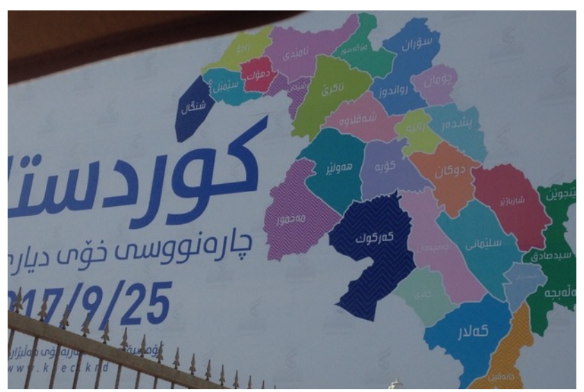
Figure 22 - Electoral map on the outside of the Independent High Elections and Referendum Committee building

Online and off, I tried to find as many maps of Kurdistan as I could. I then compared them to an official map of Iraqi territory partitioned by its nineteen provinces; the differences were subtle, yet vast in their ramifcations.