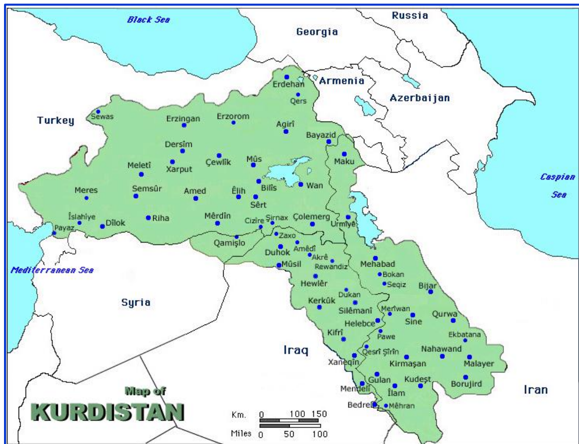
Figure 1: Map of Kurdistan

Estimates of the area of the land where the Kurds constitute the dominant majority range from 230,000 to 300,000 square miles in size, divided as follows: Turkey (43% of the total area of Kurdistan), Iran (31%), Iraq (18%), Syria (6%), Armenia and Azerbaijan (2%) (ibid.).