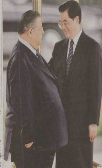
President Hu Jintao greets Iraqi President Jalal Talabani at his arrival in Beijing yesterday.

Agencies in Beijing Beijing yesterday forgave a debt part of Iraq's debt and pledged to help rebuild the country's war-shattered economy.