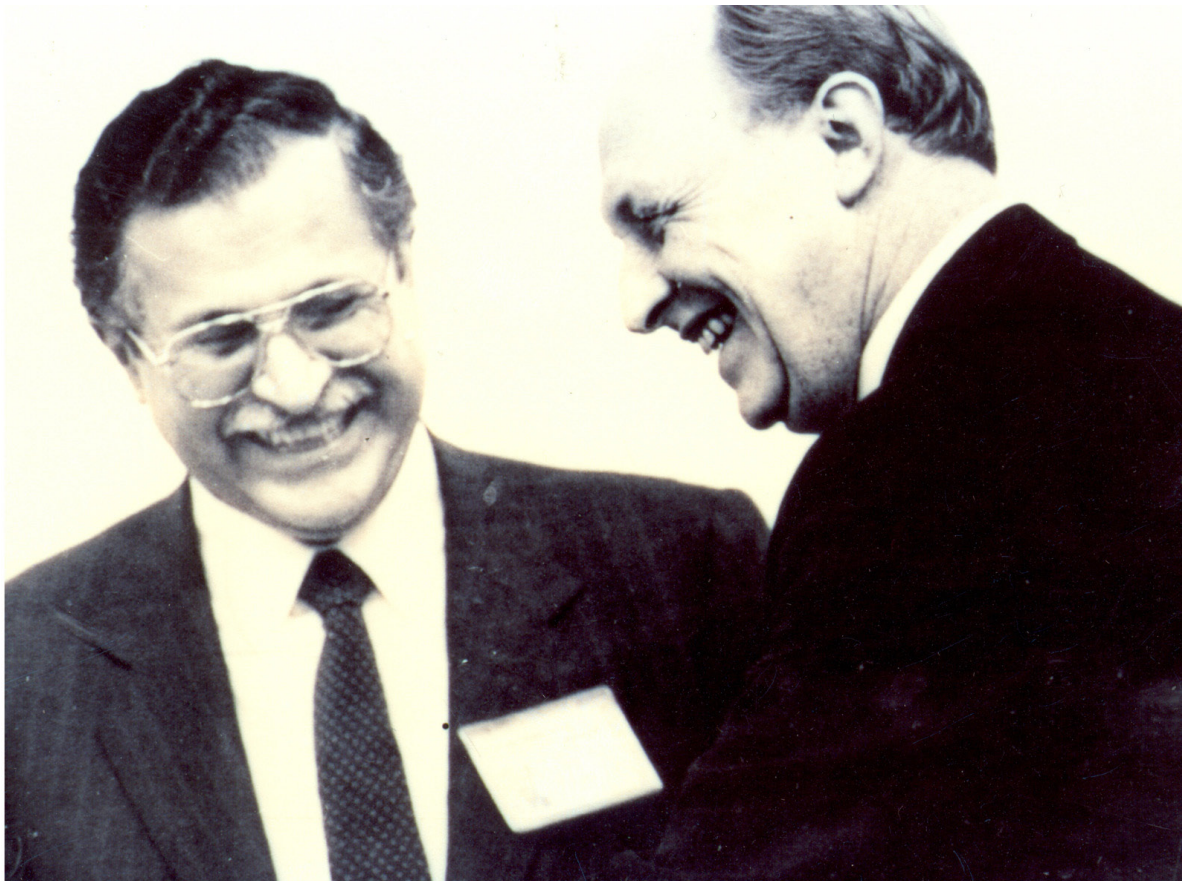
Conference – Jalal Talabani with Neil Kinnock, the Leader of the British Labour Party – 01/09/1993