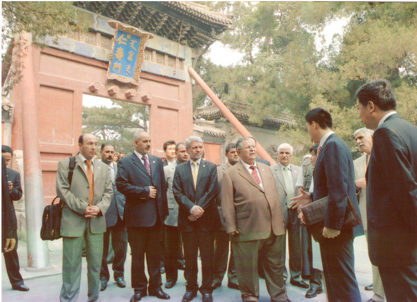
Jalal Talabani's visit to China as the President of Republic of Iraq