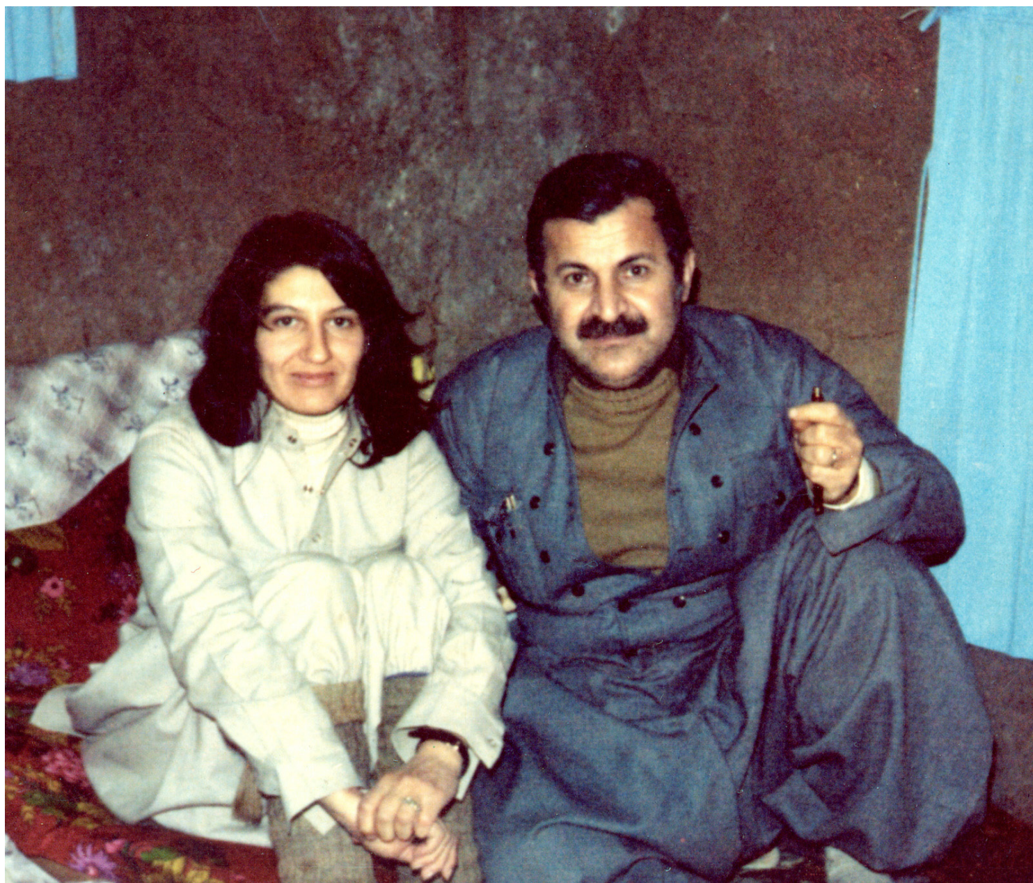
Hero Ibrahim Ahmed – Jalal Talabani