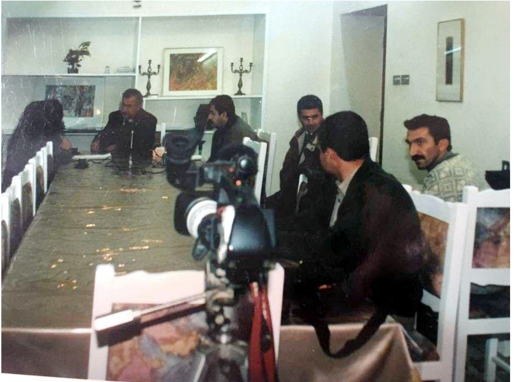
The team tasked with recording the interview