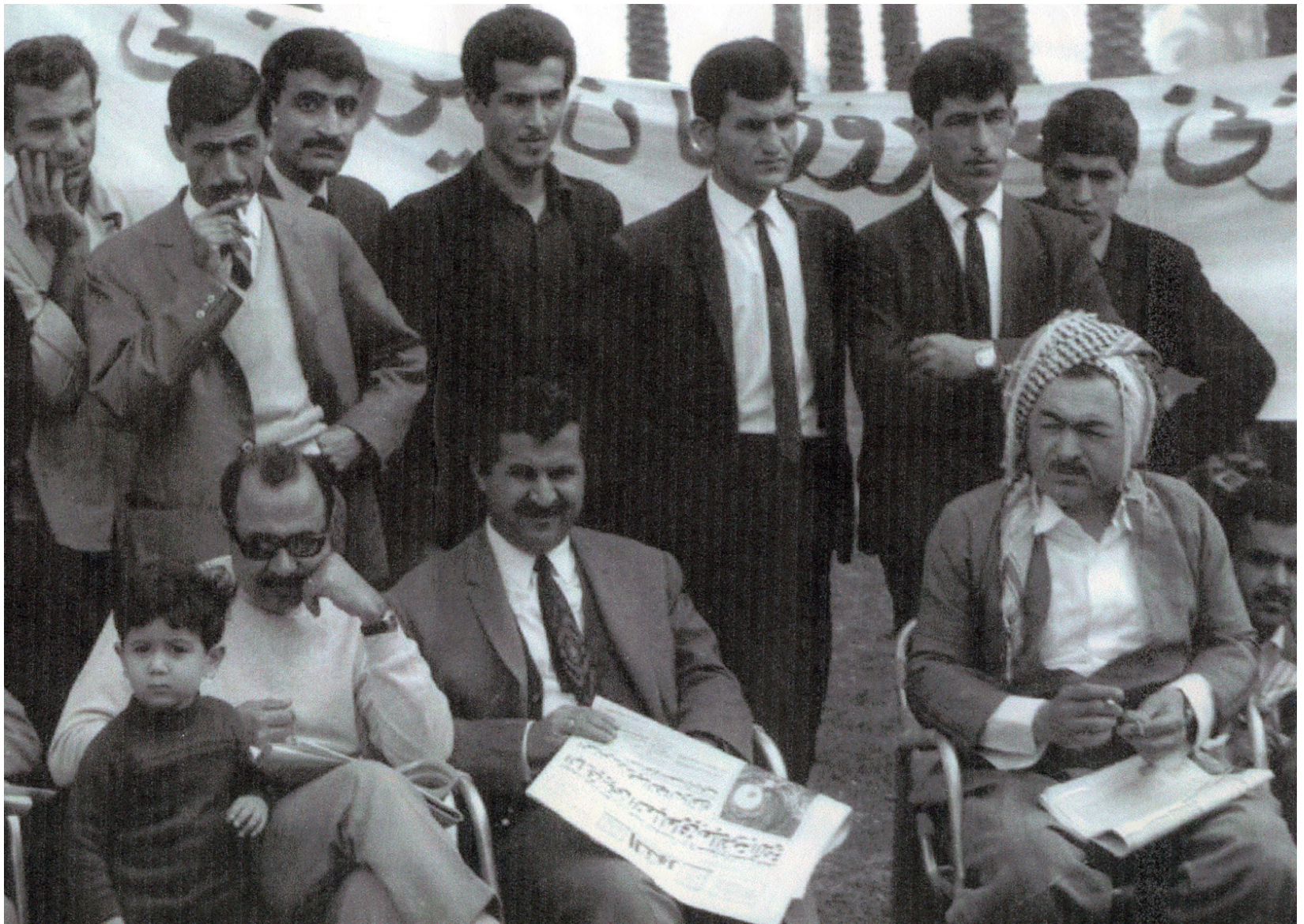
Jalal Talabani with some figures – Salman Pak City – Baghdad – 1969