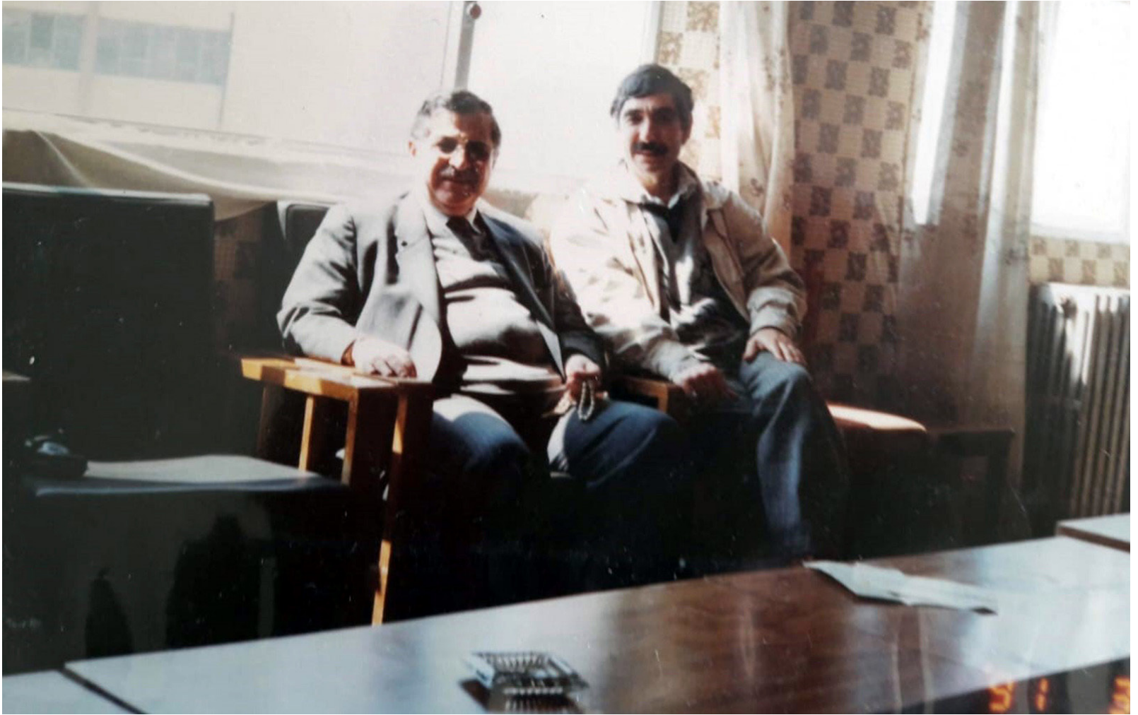
Jalal Talabani - Yousif Zozani Qamishlo 1991