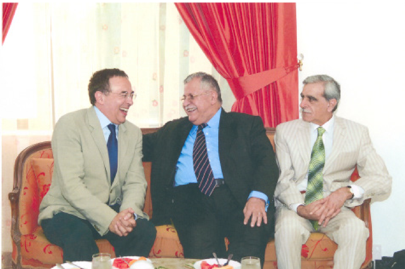
Ahmed Turk - Jalal Talabani – World Socialist Secretary in Slemani