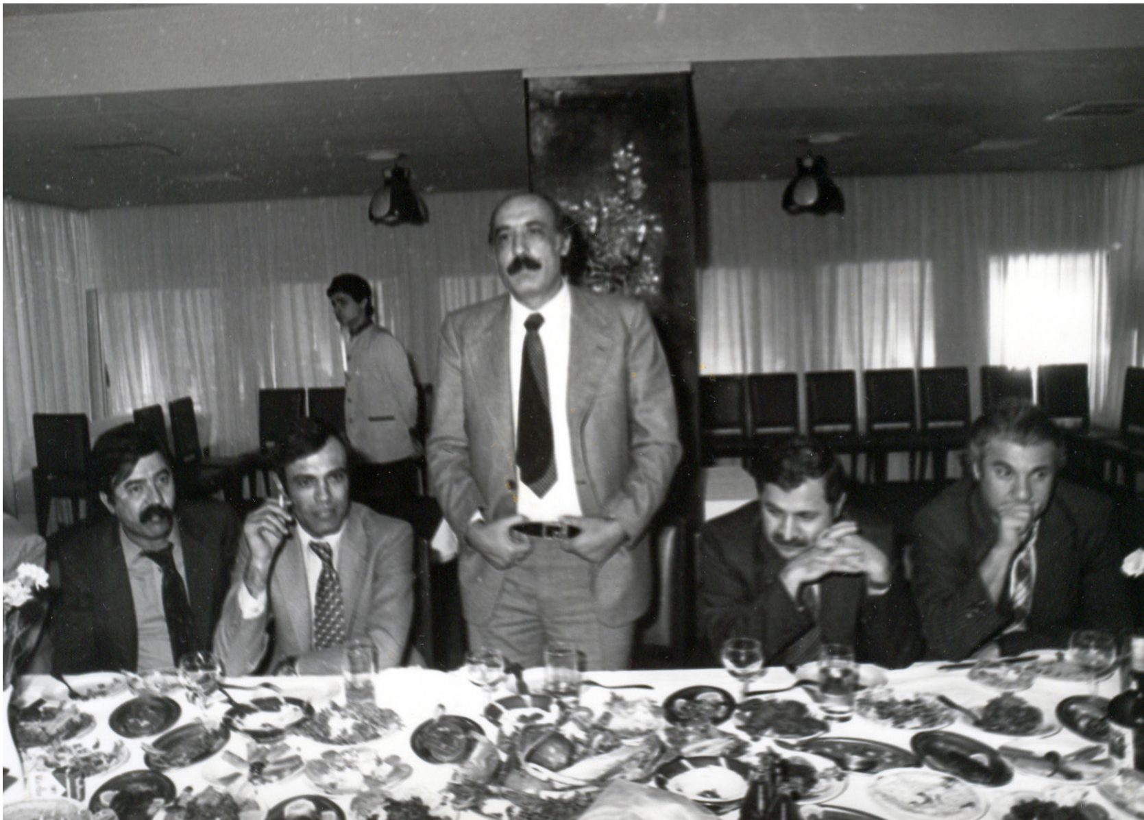
Jalal Talabani with some figures