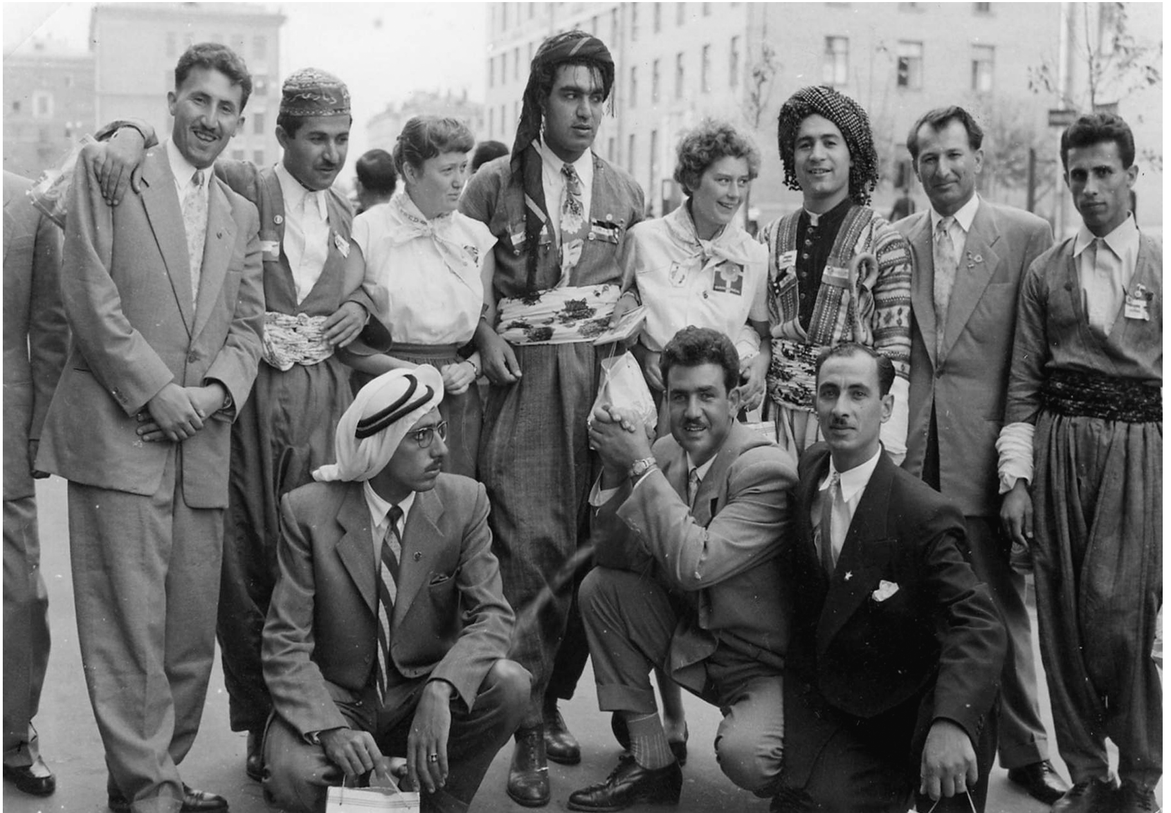
The Sixth Festival of Youth and Students in Moscow – 1957