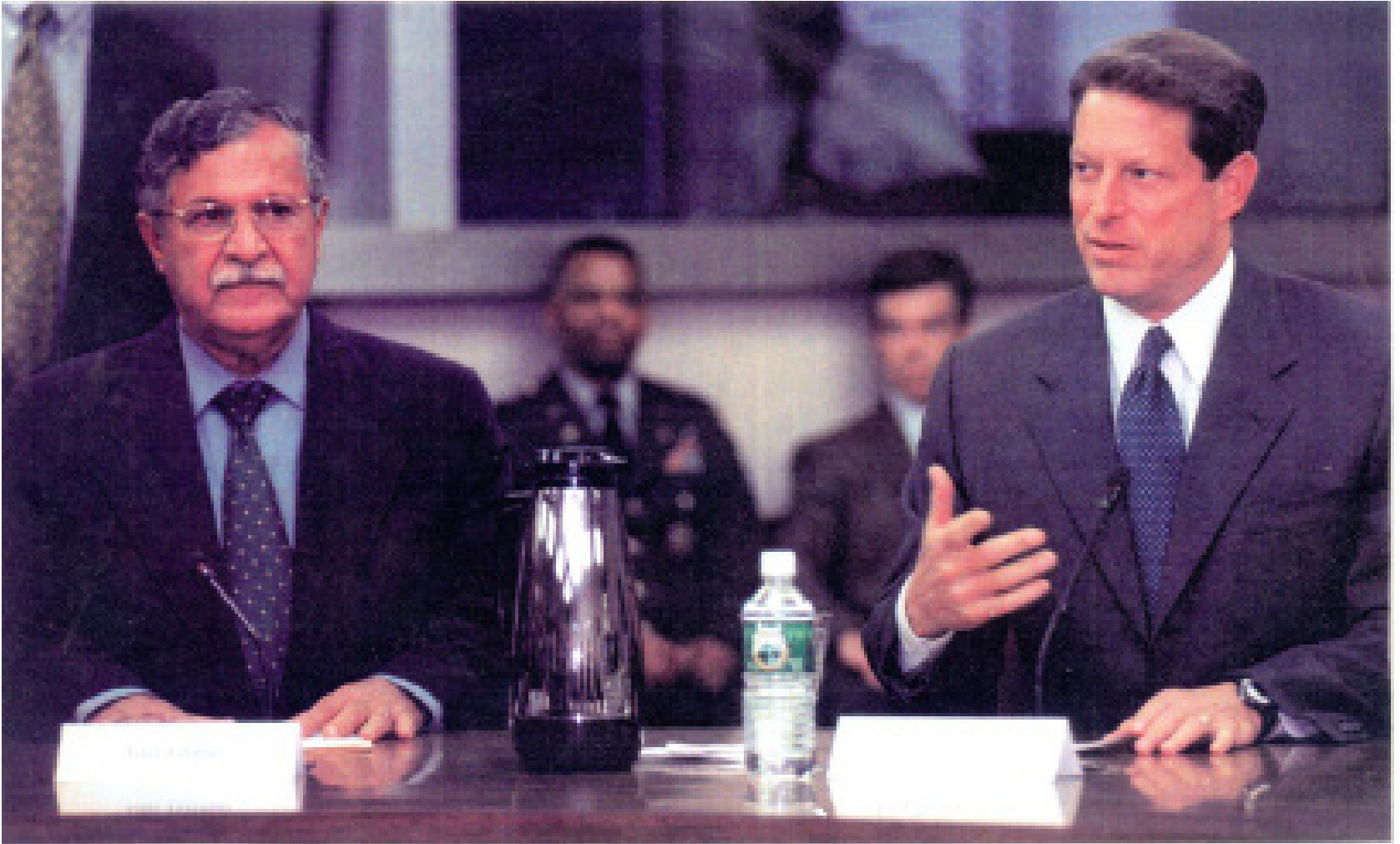
Jalal Talabani - Al Gore , Former US Vice President