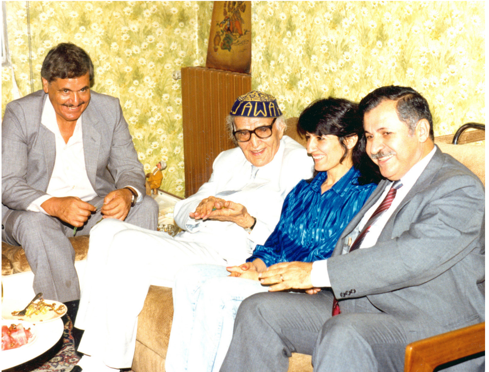
Jalal Talabani – Hero Ibrahim Ahmed – Mohammed Mahdi Al- Jawahiri Damascus – 1987