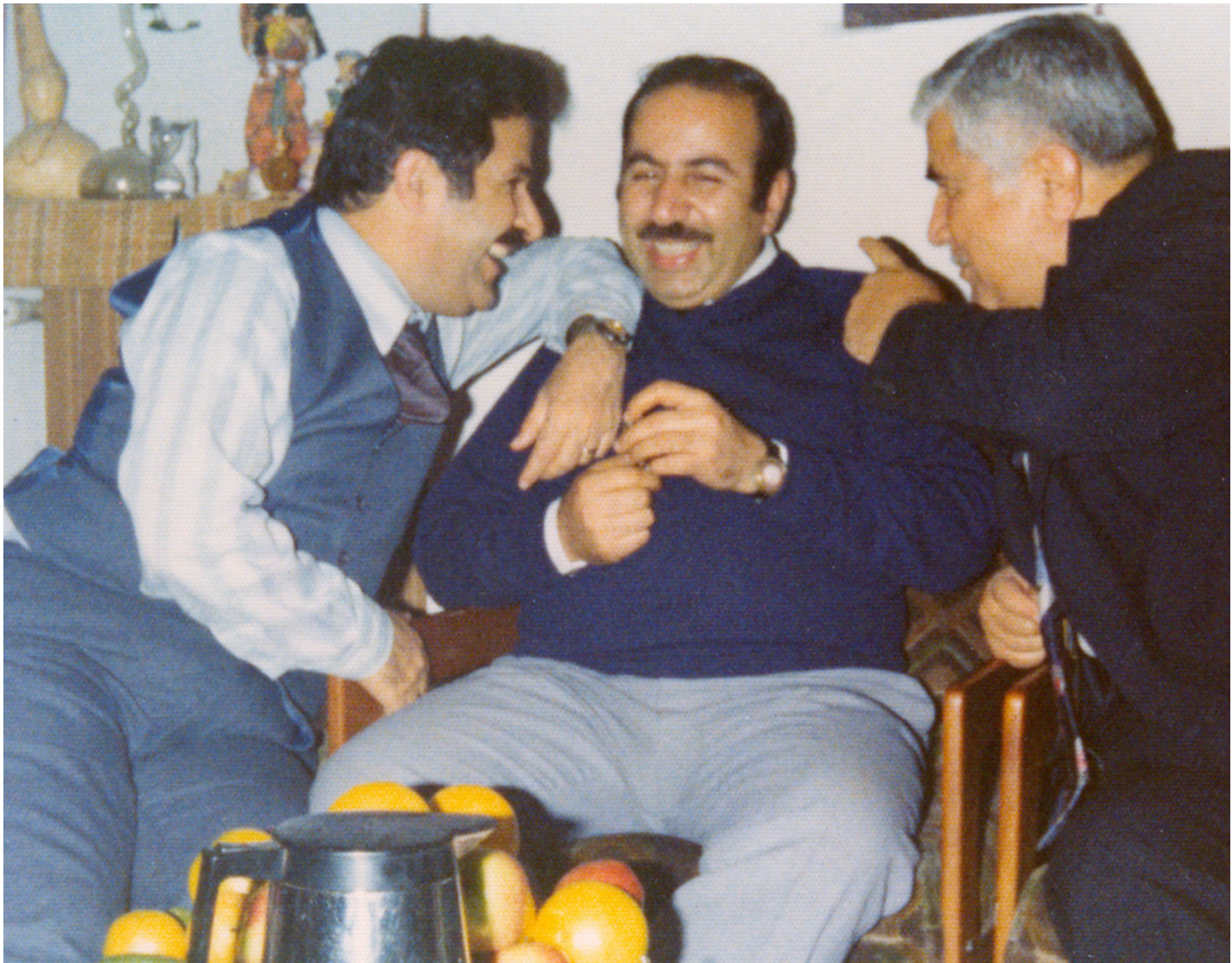
Jalal Talabani with some friends