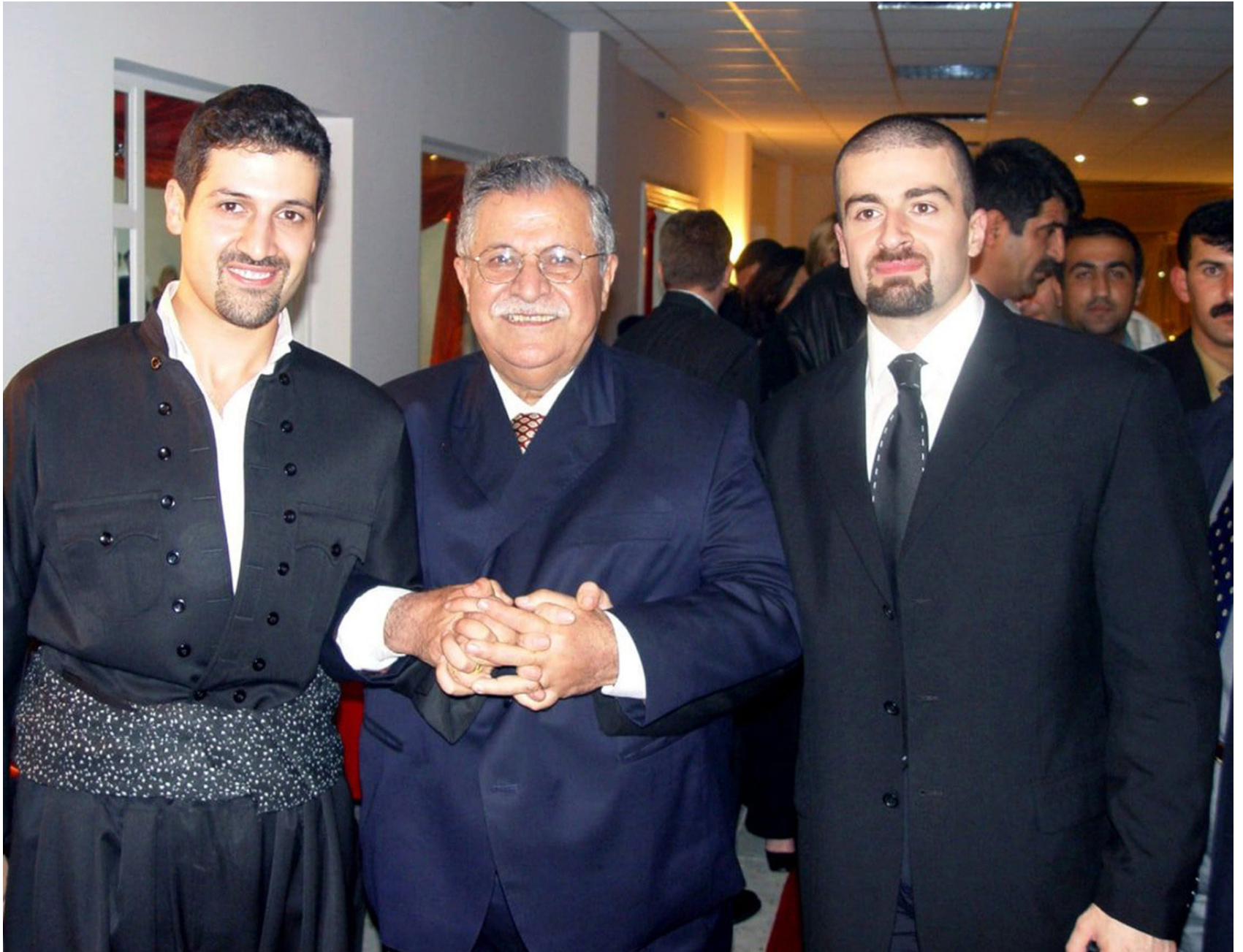
Qubad Talabani– Jalal Talabani – Bafel Jalal Talabani Qubad’s Wedding Day