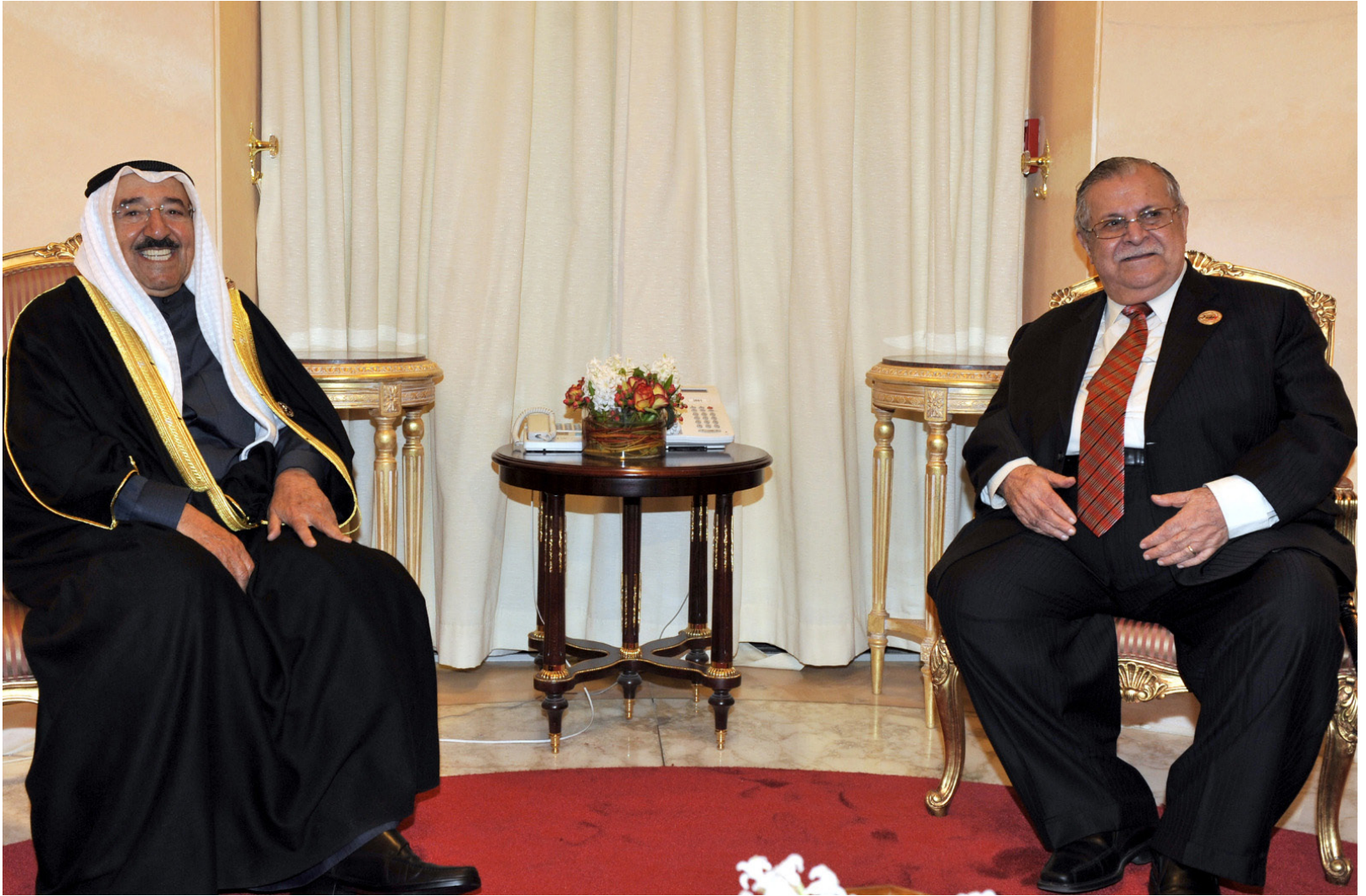
Mam Jalal – Sheikh Sabah Jabir the late prince of Kuwait