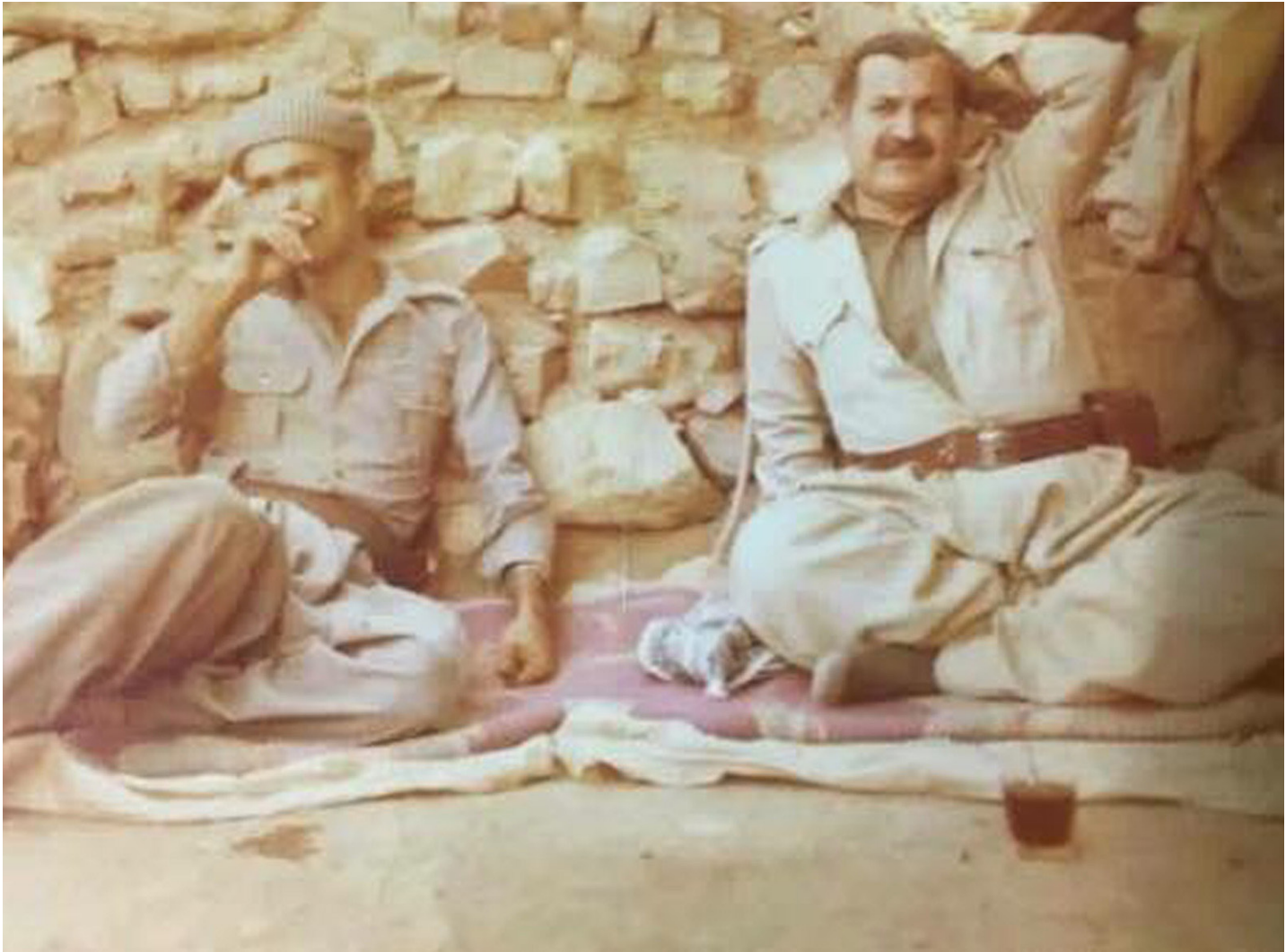
Nawshirwan Mustafa – Jalal Talabani