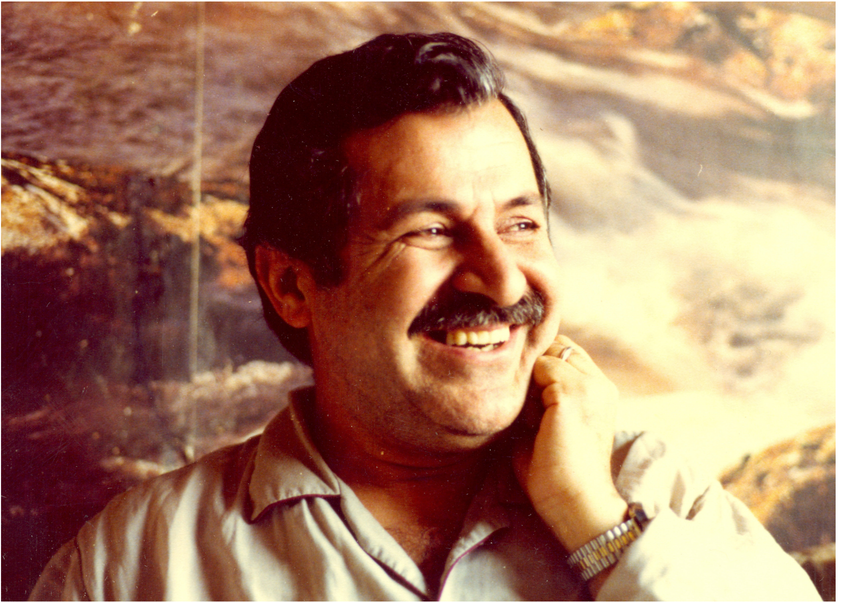
A Unique photo of Jalal Talabani