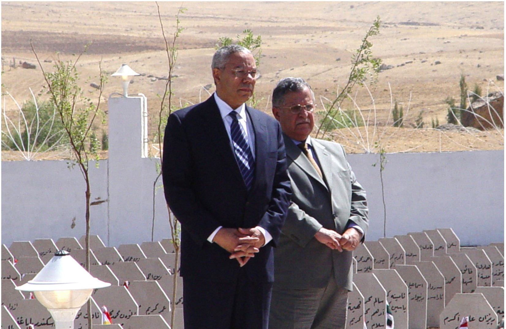
Jalal Talabani – Colin Powell, the former US Secretary of State Halabja