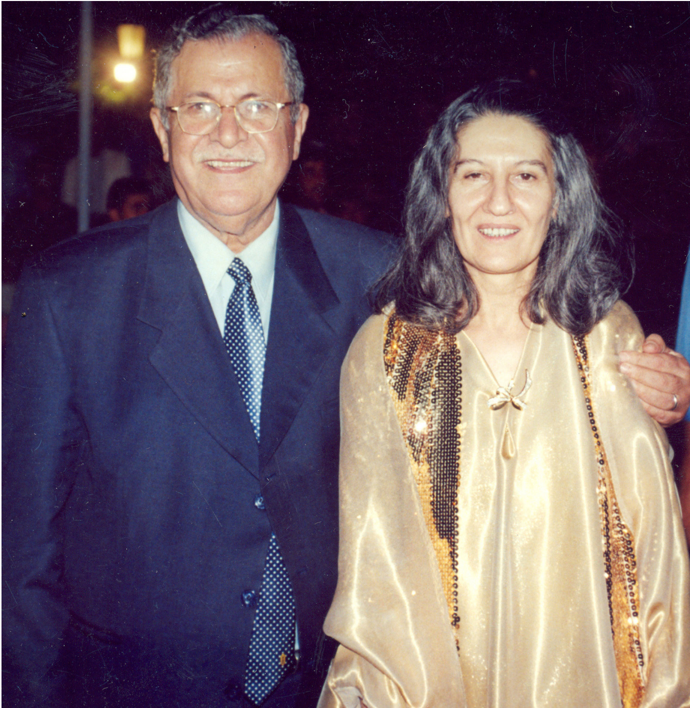
Jalal Talabani - Hero Ibrahim Ahmed