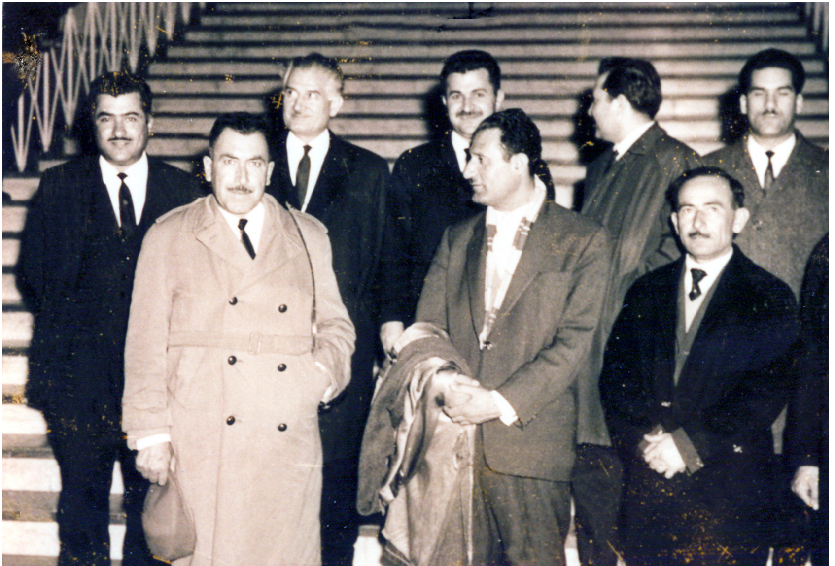
Jalal Talabani – Ibrahim Ahmed – Some dignitaries