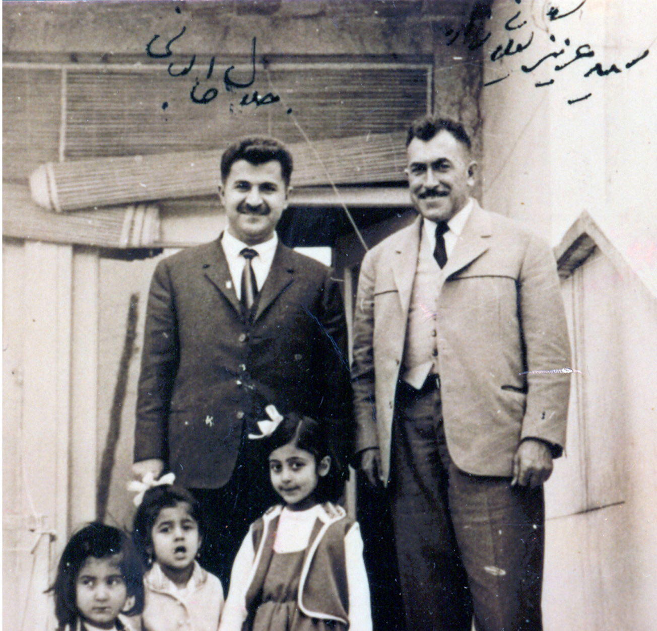
Jalal Talabani - Saeed Aziz