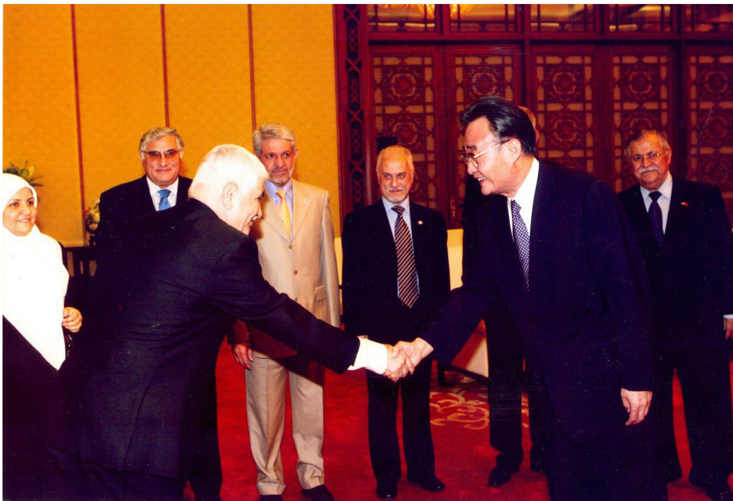
Iraq Highi Delegation in China