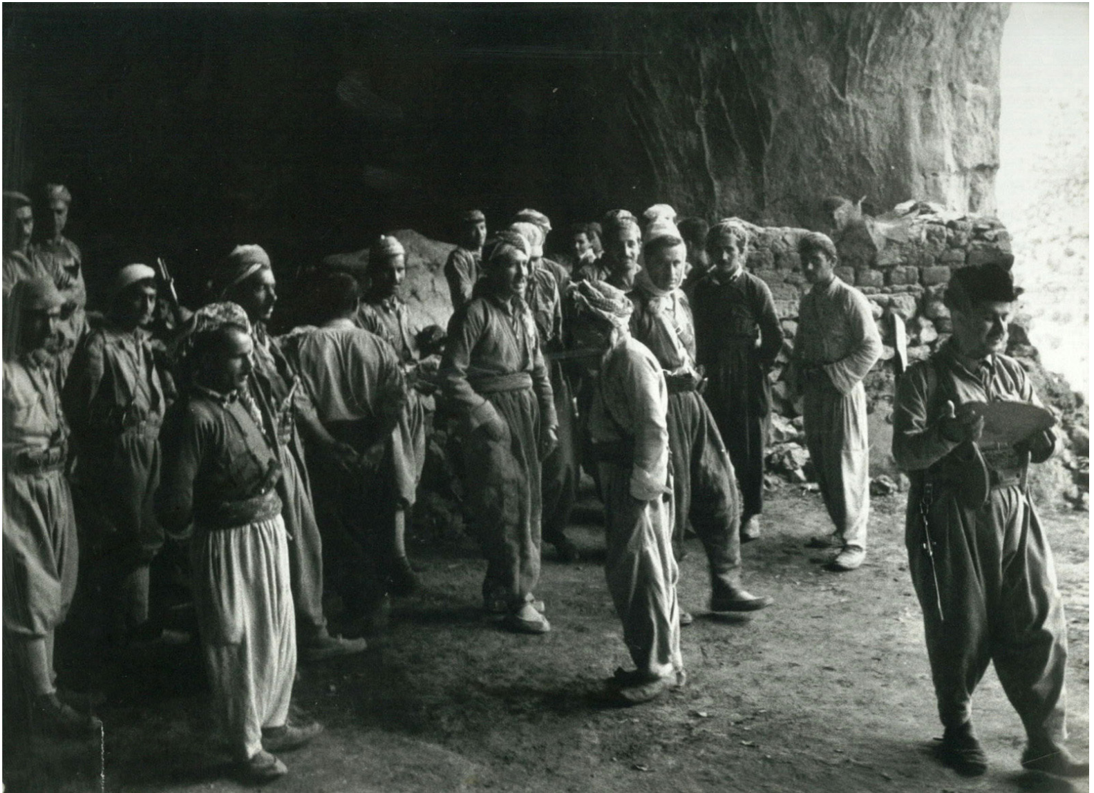
Jalal Talabani with a number of Peshmarga and Leaders during the days of struggle