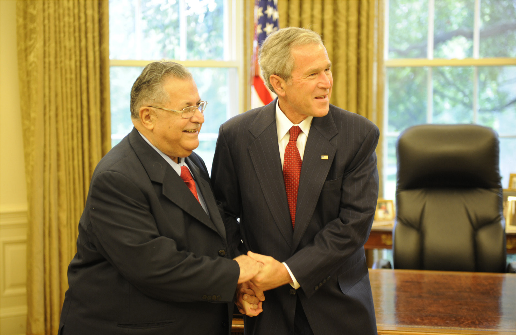
Jalal Talabani - George W. Bush