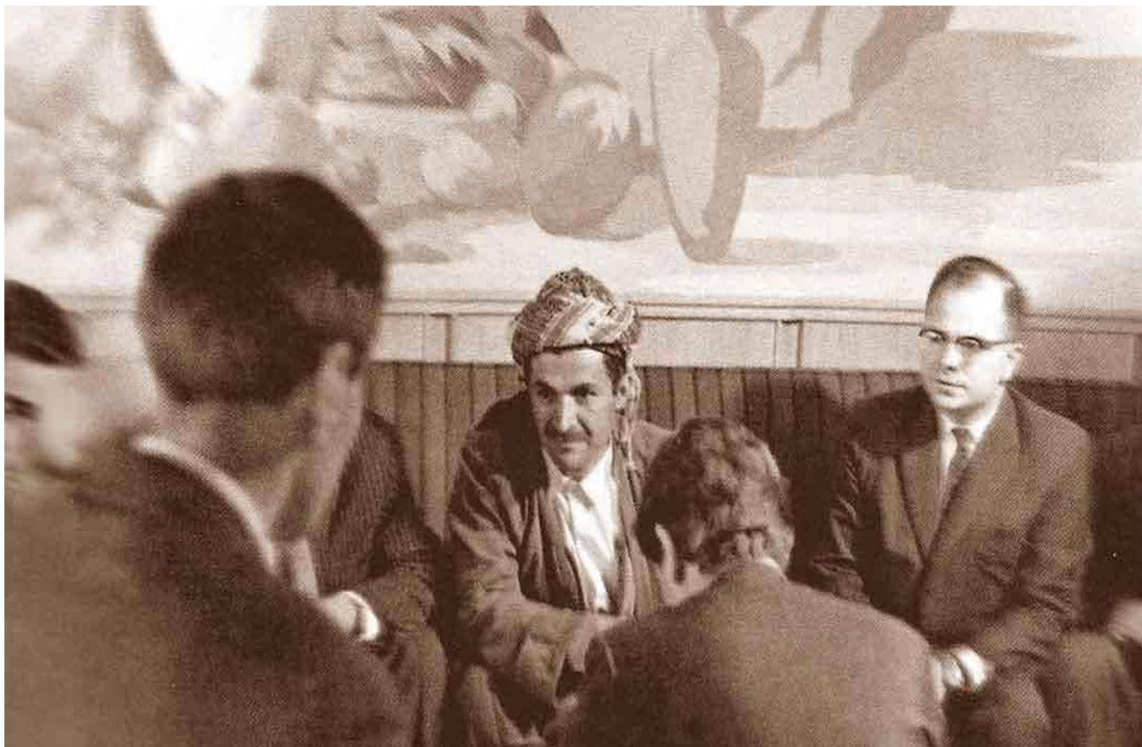
Jalal Talabani – A personality Negotiation with Baghdad – 1963