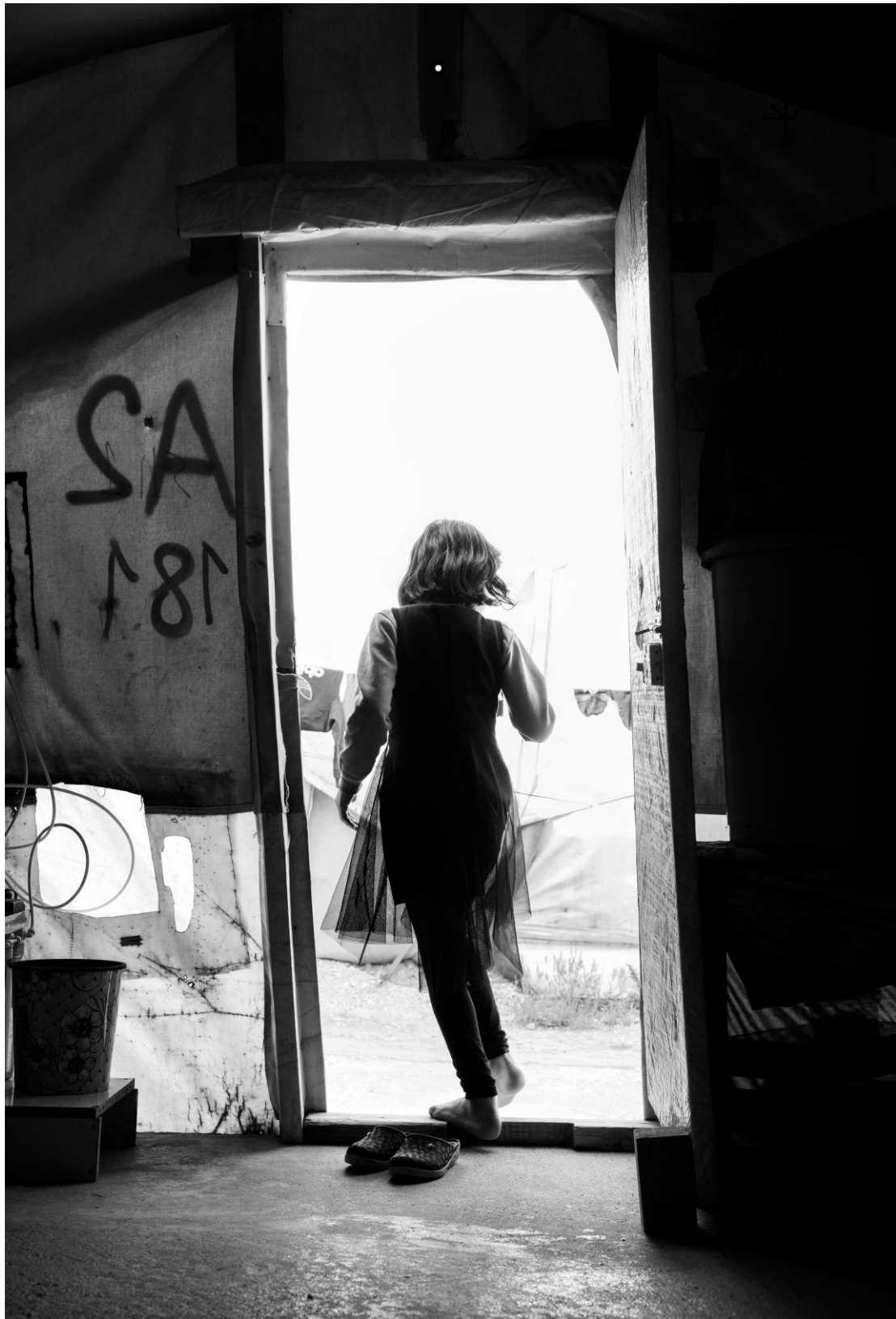
A Yezidi girl survivor at Sharia IDP Camp in Dohuk governorate. 18 April 2019.