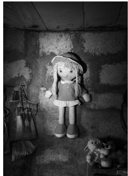
A doll on the wall where a boy child survivor lives with his uncle and aunt in Khanke IDP Camp in Dohuk governorate. 20 April 2019.

Four of the five women who were separated from their children said that they had attempted to commit suicide either one or multiple times. One said she had to take sleeping pills and other drugs to cope. 247