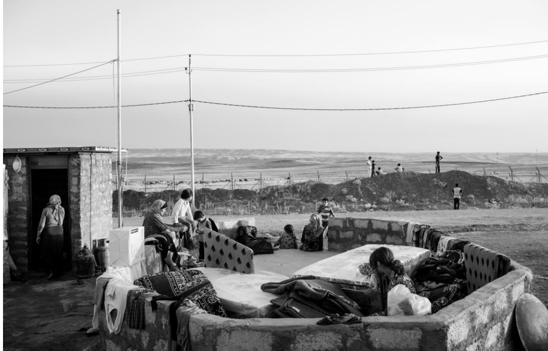
Yezidis who fled their homes in the Sinjar region take shelter at Bajid Kandal IDP camp in Dohuk governorate. 7 August 2014.

Other crimes committed by IS against the Yazidi community include the destruction of several important Yazidi temples and shrines and the looting and destruction of Yazidi homes. 29 An extensive retrospective survey has calculated that in August 2014 alone, IS killed 3,100 Yazidis and abducted 6,800 more. According to this survey, children under the age of 14 made up 33.7% of the total abductees. 30 According to Al-Monitor , the United Nations Investigative Team to Promote Accountability for Crimes Committed by Da'esh/Islamic State in Iraq and the Levant (UNITAD) stated at a Baghdad press conference in April 2020 that 73 mass graves of Yazidis have been found in Iraq since 2014, 13 of which have been exhumed. 31 The Kurdistan Regional Government's Office of Kidnapped Yazidis, based in Dohuk, estimated that as of February 2020, 2,884 Yazidi adults and children remain missing. Many of these adults and children are believed to still be in IS captivity. 32