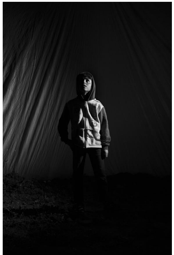
A Yazidi boy survivor in the village of Sharia in Dohuk governorate. 20 April 2019.

Humanitarian workers as well as child survivors and caregivers interviewed for this report said there were no resources of which they were aware, whether offered by local or international NGOs or by government authorities, to help them address and overcome these language barriers.