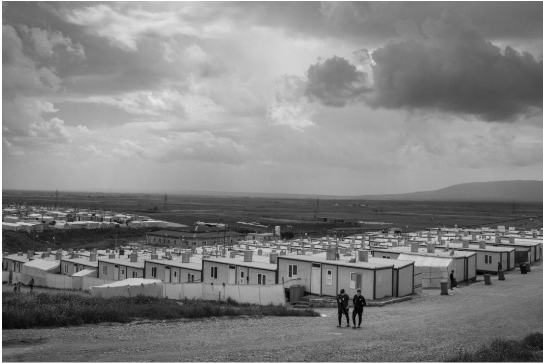
Mamrashan IDP Camp, Dohuk governorate.