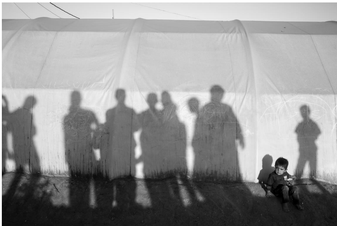
A Yazidi boy sits near a shelter in an IDP camp in Dohuk governorate. 7 August 2014.