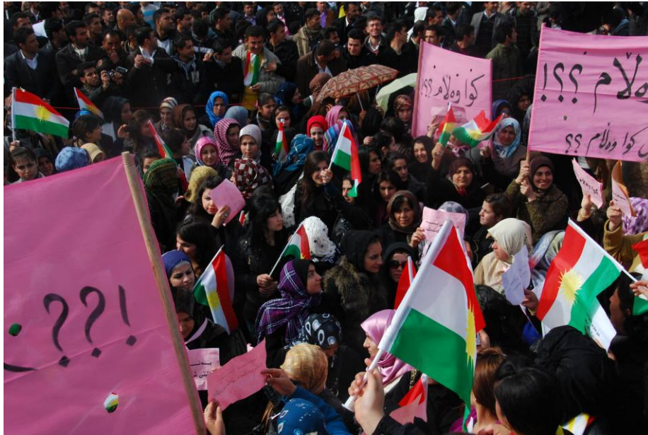
Demonstration on 8 March, International Women's Day 2011, at Sara Square, Sulaimaniya