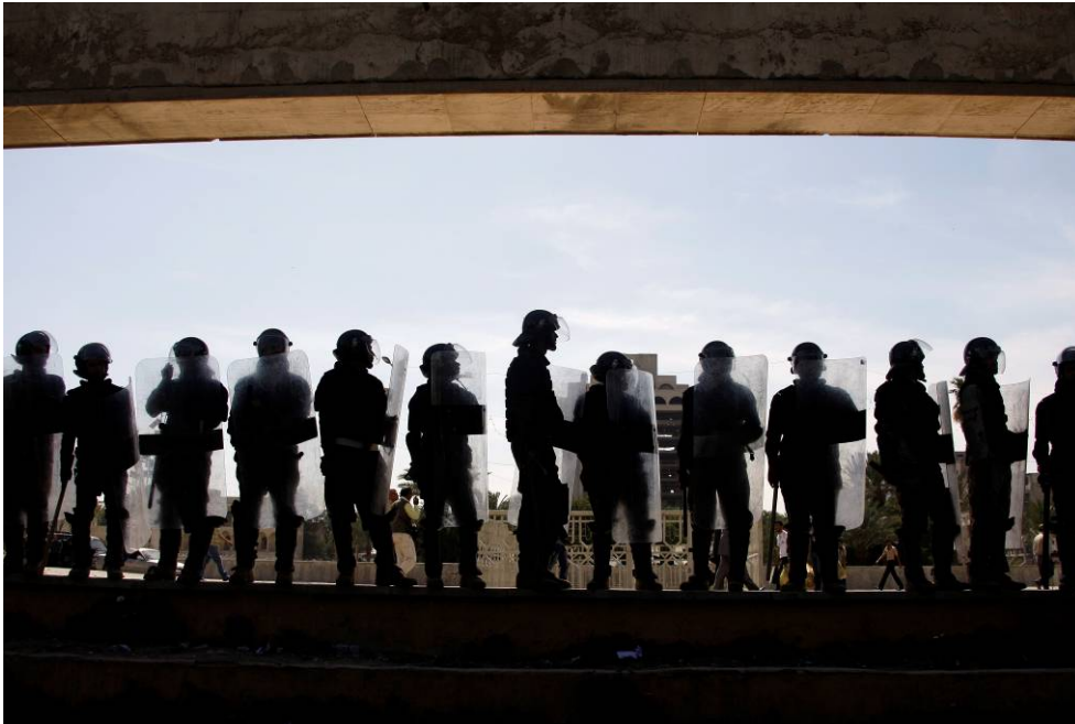
Riot police stand guard during a demonstration in Tahrir Square in central Baghdad, 18 March 2011

The cases highlighted below and other evidence gathered by Amnesty International show that on several occasions Iraqi armed forces and security forces breached these standards and used excessive force, in some cases leading to deaths. They also violated the right to life as enshrined in Article 6 of the ICCPR. The UN Human Rights Committee, in its General Comment No. 6, noted that the right to life is non-derogable even in cases of “public emergencies”. The Committee added: “States should take measures not only to prevent and punish deprivation of life by criminal acts, but also prevent arbitrary killings by their own security forces.” The prohibition of torture and other cruel, inhuman or degrading treatment or punishment is also non-derogable.