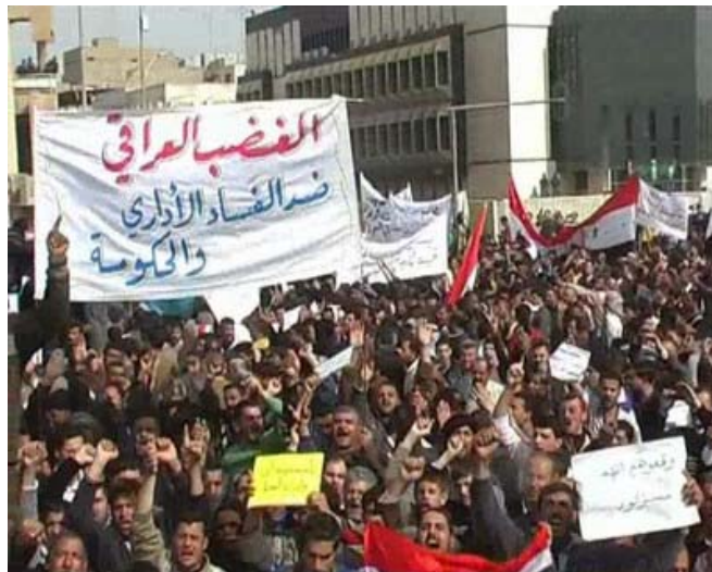
Protesters carrying a banner with the slogan “Iraqi Rage” at a demonstration on 25 February in Mosul calling for better services and an end to corruption

Protests initially erupted in Iraq in mid-2010 over the government’s failure to provide basic services, but then stalled. For example, on 19 June thousands of people protested in Basra against the frequent power cuts. According to reports, at least one person was killed in front of the provincial council building when police fired on stone-throwing demonstrators. 1 In response to this and other protests, the Electricity Minister resigned and on 25 June the Interior Ministry issued new regulations that make it extremely difficult to obtain official authorization to hold protest meetings or demonstrations.