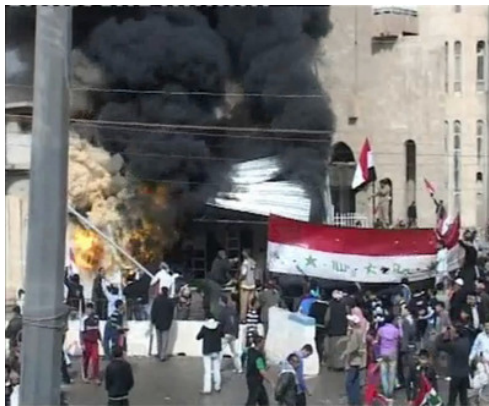
A fire lit outside the Provincial Council building in Mosul on a day of protests, 25 February 2011

Since mid-February 2011, many people have been killed or injured in violent clashes between demonstrators and forces under the control of the Iraqi authorities, and several demonstrators have been shot dead by armed forces, security forces or security guards in circumstances where the use of live ammunition constituted excessive force.