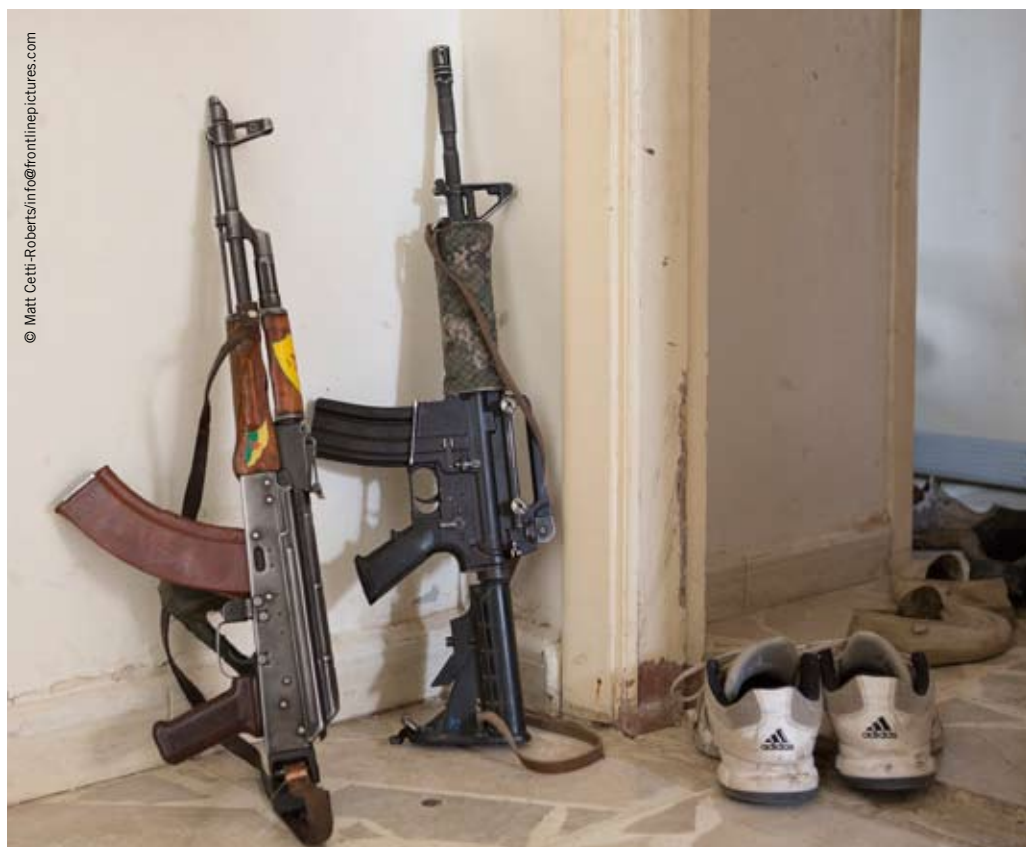
A Chinese-made Kalashnikov and an American M4 rifle (the latter captured from IS fighters) lean against a wall in a building occupied by Syrian Kurdish People's Protection Units fighters in Al-Yarubiyah, Syria, September 2014.