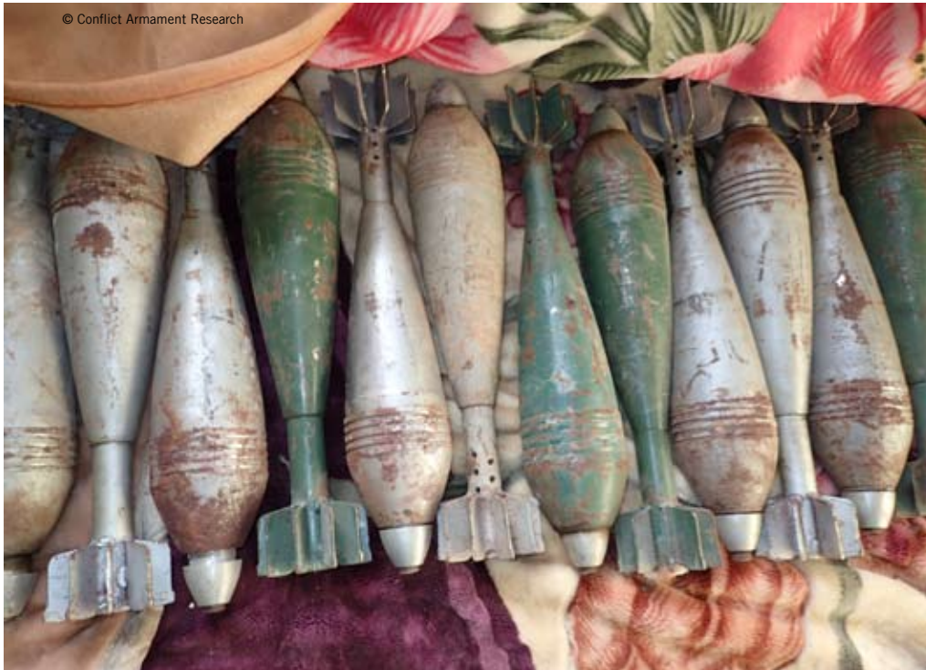
Improvised mortar rounds manufactured by IS forces and captured by Syrian Kurdish People's Protection Units documented by a Conflict Armament Research Field Investigation team on 21 February 2015 in Kobane.

IS captured an unknown quantity of 155mm M198 towed howitzers from Iraqi military stocks during its capture of Mosul in June 2014, along with the older Chinese Type 59-1, which the Iraqi army used extensively during the 1980-1988 Iran-Iraq war. 23 IS has also captured former Soviet Union D-30 and M-30 122mm howitzers from Syrian military stocks and small numbers of the older, and now obsolete, M-30 models which were probably taken from the Syrian army's reserve storage for deployment.