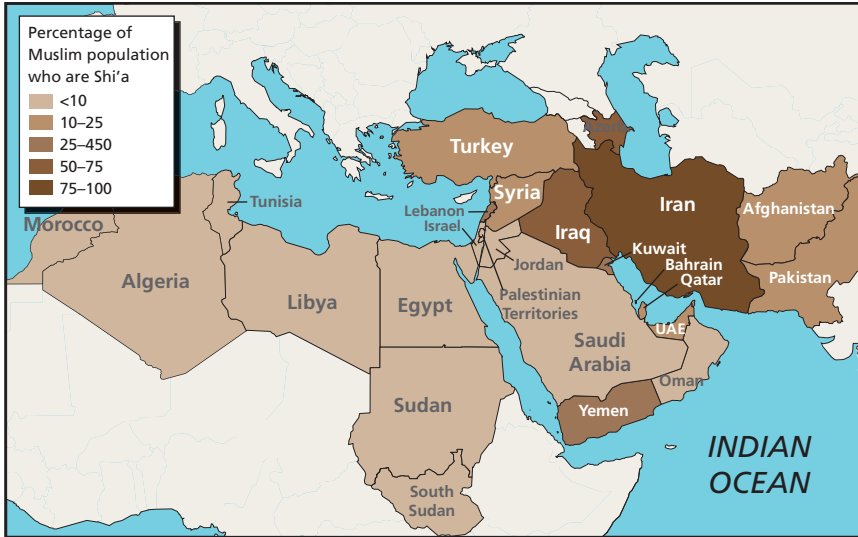
Figure 2.1 Shi'a and Sunni Populations in the Middle East