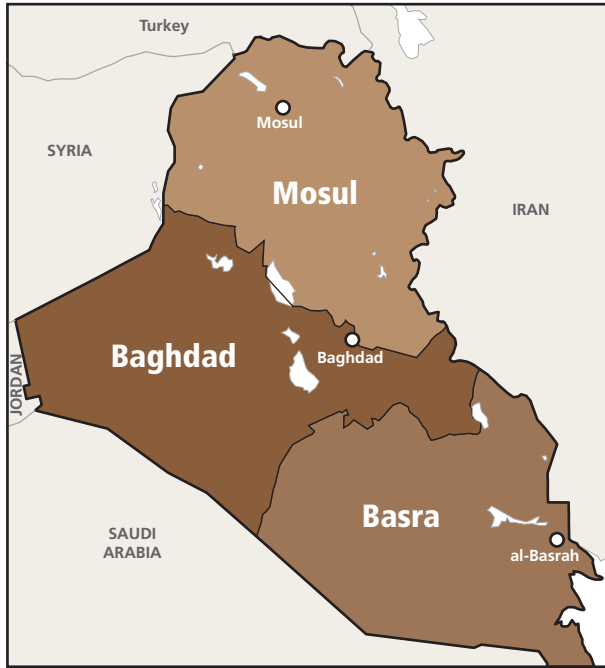
Figure 3.1 Ottoman Provinces of Iraq Pre-1916