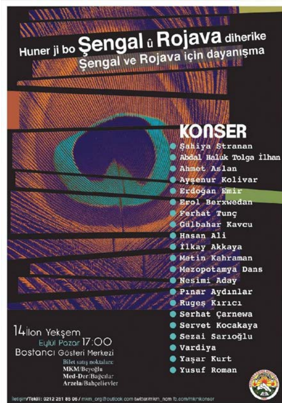
Figure 2: The flyer for the Şengal concert. Across the top, it reads “Art flows for Şengal and Rojava” (Kurdish) and “Solidarity for Şengal and Rojava” (Turkish). Along the right side is a list of the artists who performed in the concert, including the ensemble Şahiya Stranan. Underneath information about time and place on the left side, the three MKM-affiliated cultural centers are listed as ticket sales points. The peacock feather is a reference to the centrality of Tawûsê Melek, the Peacock Angel, in Yezidi belief.

boxes, doors led to the main hall, an auditorium with seating for more than 1,500 people and additional standing room for many more on the floor in front of the stage. As people began to arrive, the logo of the MKM was projected onto a circular screen above the stage; there, a few musicians set up musical instruments and other amplification equipment.