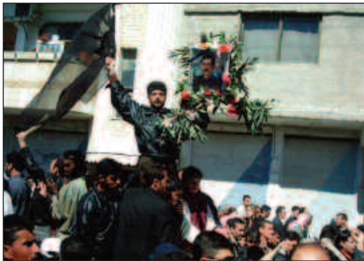
Demonstrators at funeral, Qamishli, 13 March 2004.