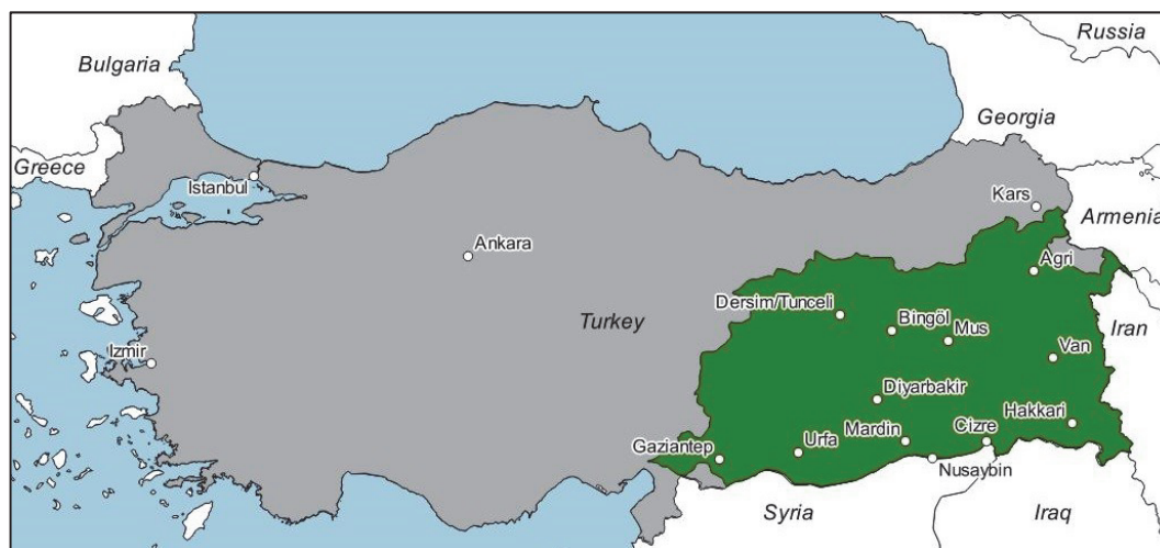
Figure 1: Map 6

The Kurdish nation straddles four contemporary states: Turkey, Syria, Iran and Iraq. The Kurdish population in Turkey is the largest of the four, numbering between 12 and 15 million or 18–23% of Turkey's population (Gunter 2010). The area of Kurdistan within the Turkish state's boundaries is known as Northern Kurdistan or Bakurê by many Kurds, rejecting Turkey centric terms like the 'South East' or the East (Jongerden 2007: 30; Gündoğan 2011).