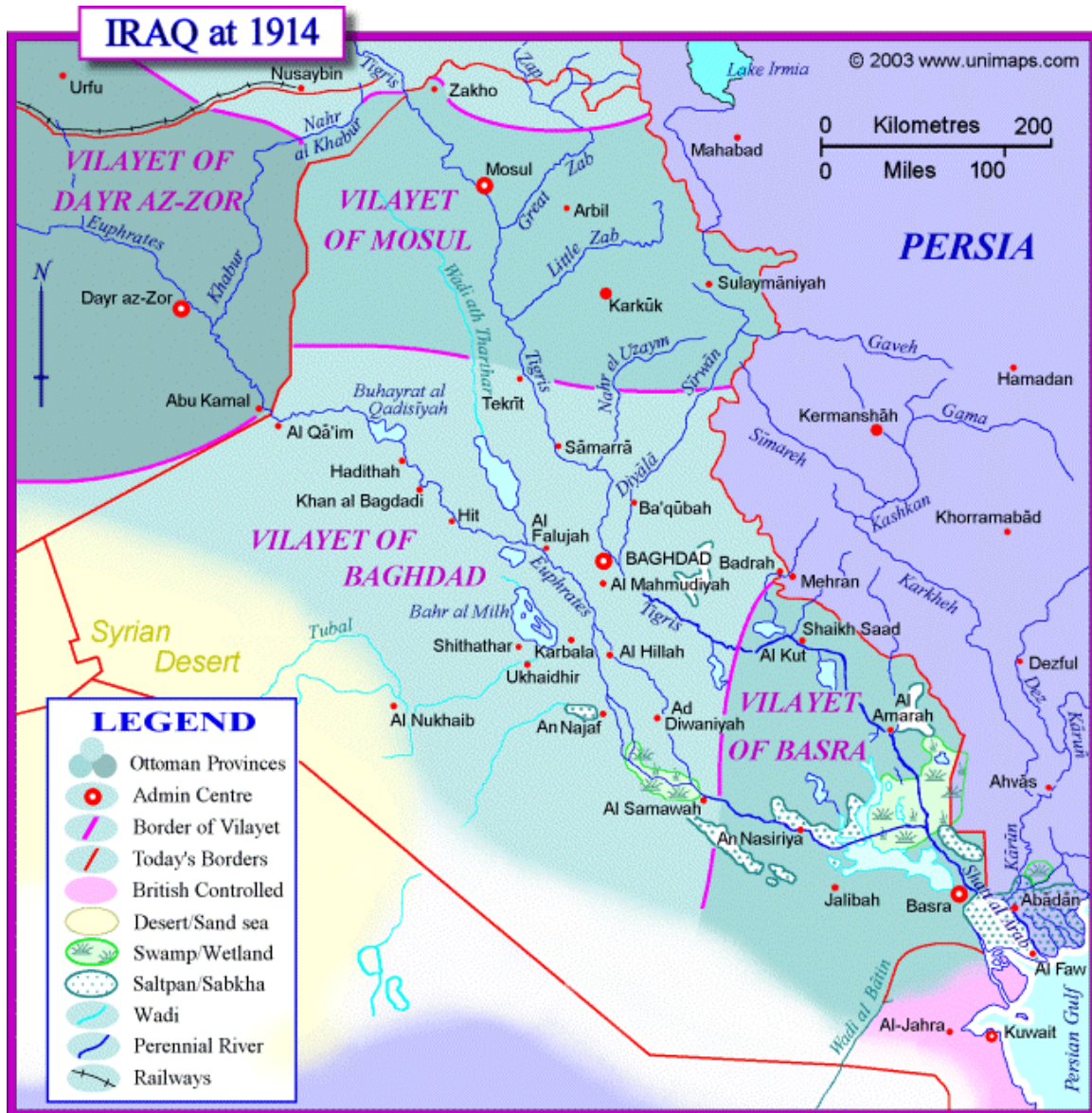
Figure 1. Iraq at 1914