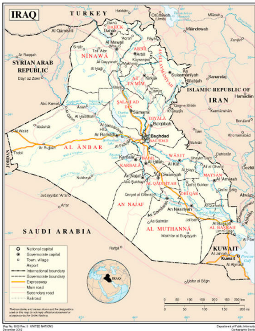
Figure 4. Iraq 2002