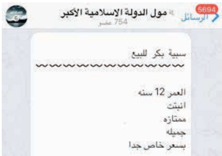
A redacted screenshot from another ISIL online sales group called "The Great Mall of the Islamic State" which, at the relevant time, consisted of 754 members. The screenshot shows a group member offering a "virgin sabiyya " for sale with the following specifications: 12-year-old, pubic hair started to grow (inferred through the common use of the term 'she has grown'), excellent, beautiful, for a special price.