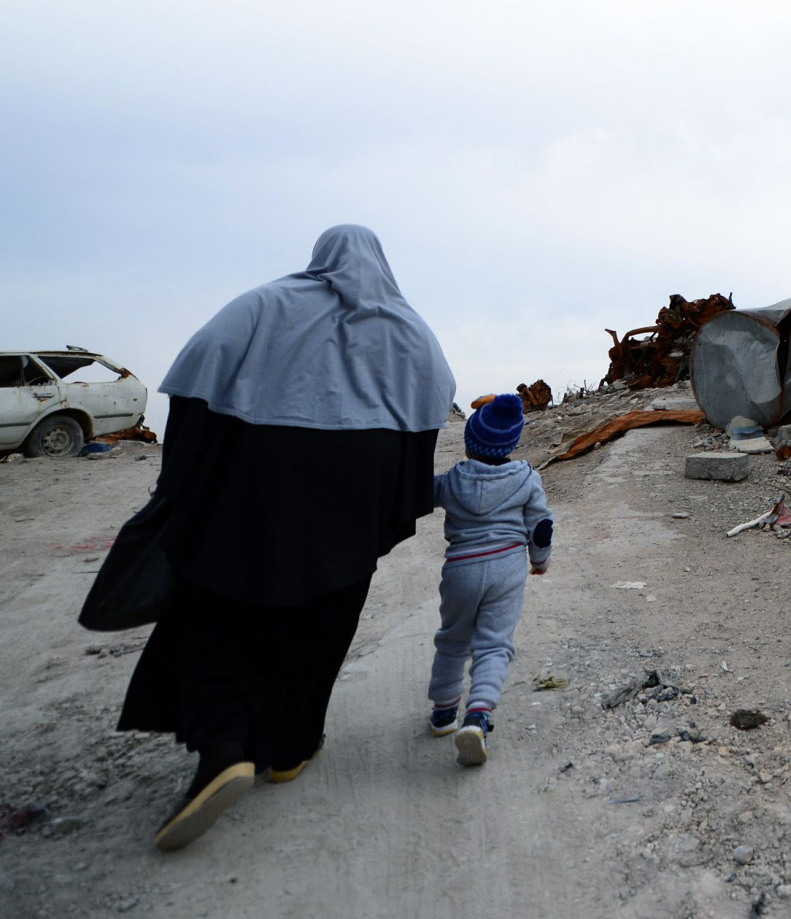
An Iraqi woman walks with her child past a destroyed house in Mosul, Iraq, Photo: Shutterstock.