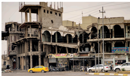
Destroyed house in Mosul, Iraq in January 2020, Photo: Enno Lenze.