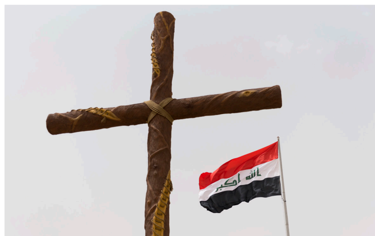
An Iraqi flag and Christian cross stand at an entrance to the predominately Christian town of Qaraqosh, Iraq, Photo: iStock.