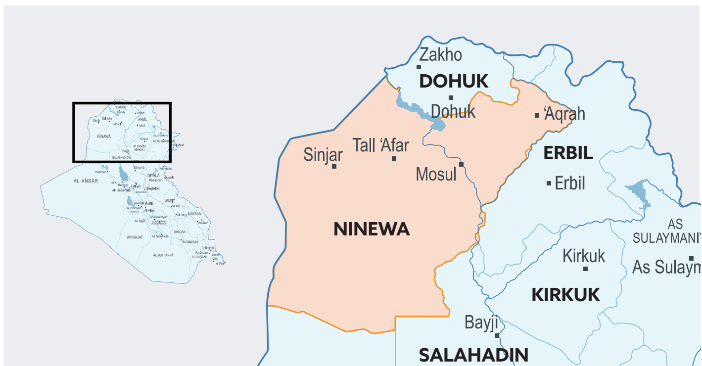
Figure 1: Map of Iraq's Ninewa Province