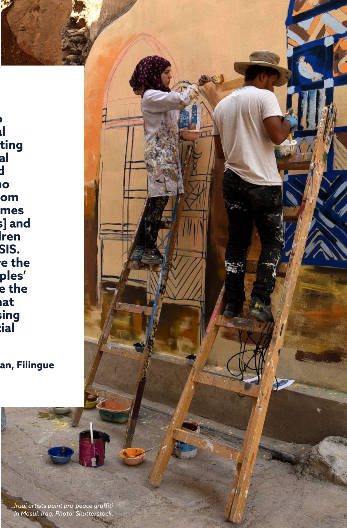
Iraqi artists paint pro-peace graffiti in Mosul, Iraq, Photo: Shutterstock.