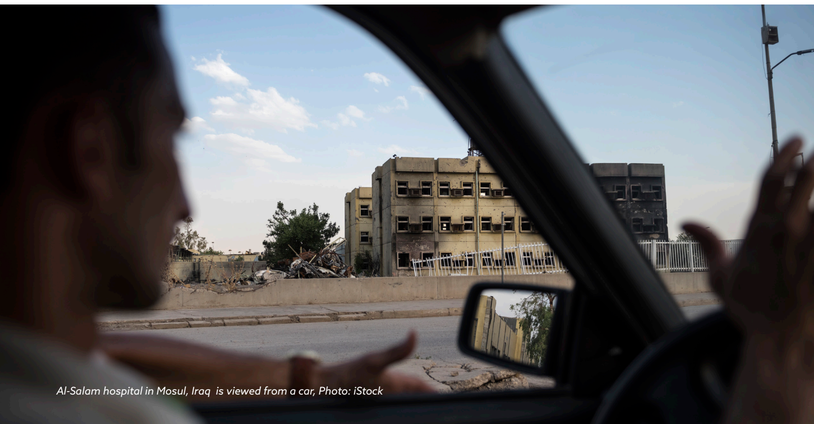
Al-Salam hospital in Mosul, Iraq is viewed from a car