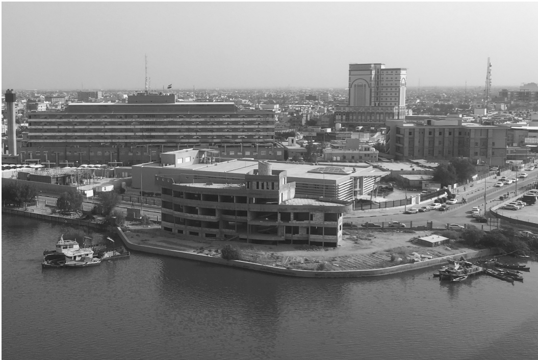
Shatt al-Arab, Basra, May 2019

Hikma, State of Law, Fadhilla, Badr and Asaib all saw their headquarters come under attack. As the new government coalesced in the subsequent months, many Iraq observers opined that Adil Abdul-Mahdi's administration would likely succeed or fail on the basis of its performance in Basra. In addition to being the country's economic hub (accounting for 80% of the country's oil production), Basra is a major base of Shia electoral support. Abdul-Mahdi simply could not afford to allow tensions to fester in the strategic province. In the aftermath of the protests in the summer of 2018, stakeholders in Baghdad and Basra convened in order to address the political crisis and to prevent a repeat in 2019. These deliberations resulted in the allocation of state money to Basra as well as the empowerment of the governor to sign off on projects without cumbersome committee oversight. At present, however, all signs point to continued disfunction, stalled projects, and low employment.