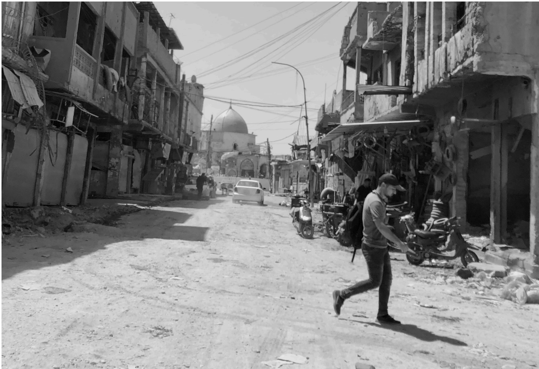
West Mosul, June 2019

What explains this outpouring of discontent against the government? Certainly one major factor is the present material condition of the city and province in the aftermath of ISIS. In Mosul city alone, there were 19,888 affected structures, 4773 of which were destroyed. More than 300,000 residents of Mosul are still displaced, with no homes to go back to two years since the liberation of the city from the Islamic State. While UNDP claims to have made considerable progress towards its reconstruction goals, the broader picture remains bleak, especially in West Mosul where most buildings remain gutted, crumbling shells.