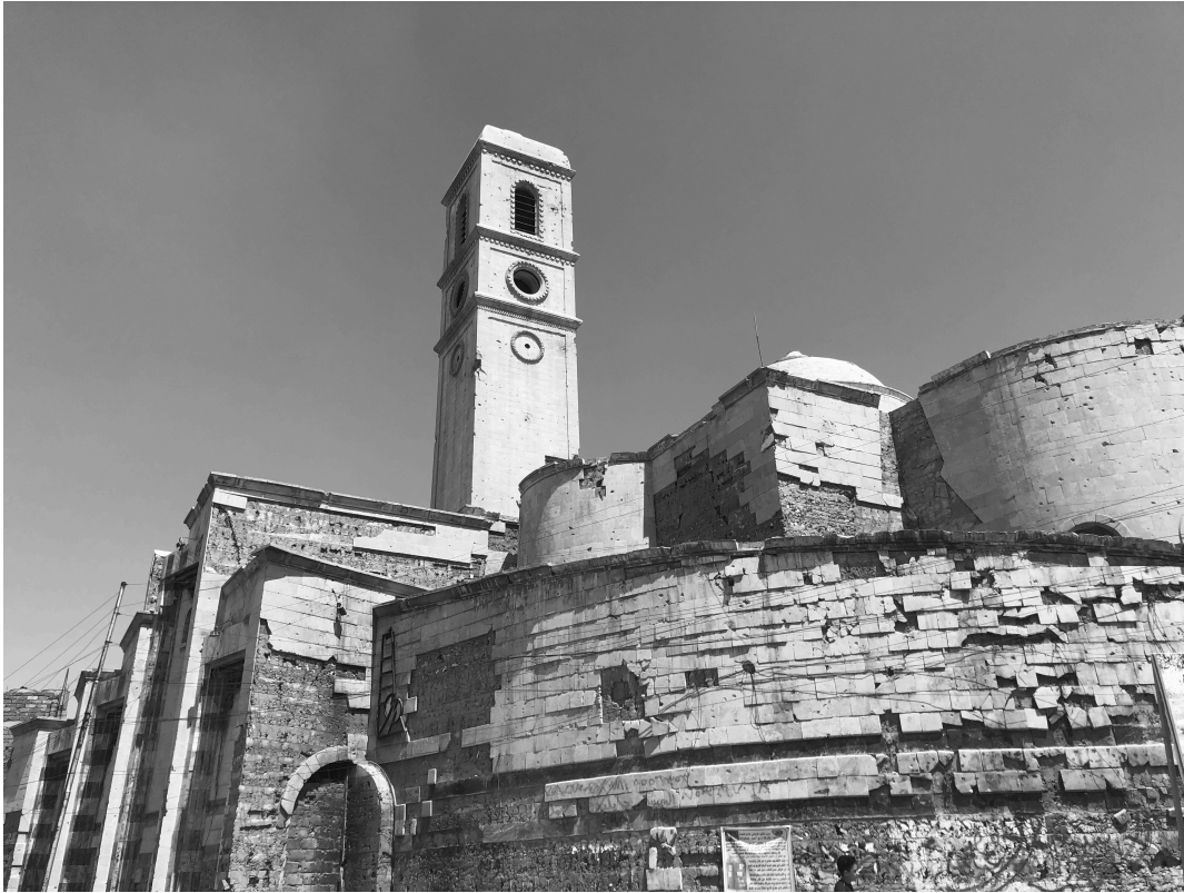
Church in West Mosul, June 2019

2015, 36 a move that solidified an already growing split between Nujaifi supporters and detractors in Mosul.