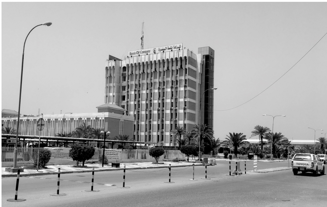
Basra Oil Company, May 2019

Corporation, 74 in addition to hundreds of international and local subcontractors, started operations in Basra's oilfields. 75 In 2010, the Ministry of Labor and Social Affairs anticipated that the deals with foreign oil companies would generate 1.3 million jobs for Iraqis. 76 With this mass influx of wealth, Basrawis started to demand not only employment but also improved services. When large protests over the lack of electricity broke out in 2009 and again in 2011, the authorities under Maliki's orders invested massively in improving electricity, particularly on transportation and distribution of power in the province.