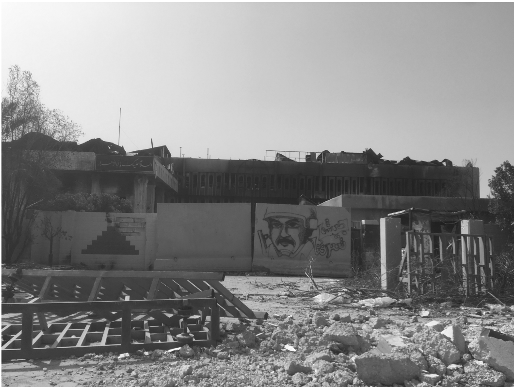
Razed government building following the 2018 Basra protests

The protest movement has increasingly become a force in Iraqi politics, proving resilient even in the midst of violent crackdowns. The 2011 demonstrations in Basra, Baghdad and Mosul were met with water cannons and harsh police tactics, leading to 10 deaths and numerous wounded nationwide. Slogans and chants called for jobs, services, and an end to corruption. The demonstrations between 2015 and 2018 were not only larger in scale but also more ambitious and absolute in their objectives. Protestors called for better services and jobs as well as a more fundamental overturning of the entire political order in place since 2003. This turn