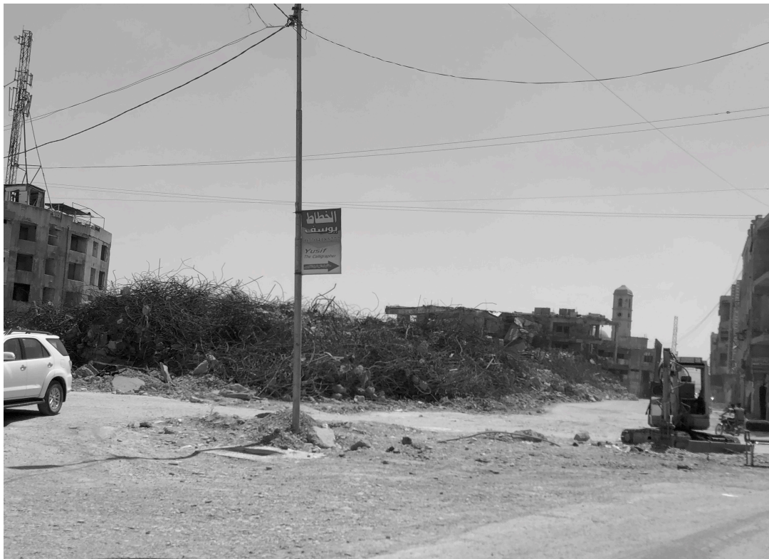
Scrap metal in Mosul (major asset in post-ISIS economy controlled by PMF-backed entities)

... tied to them – will receive the contracts to implement reconstruction projects in the province.” 55 These detractors fear that it is unlikely that members of the provincial council will be able to hold the new governor accountable given that he has the backing of powerful local and national parties. A Sunni Arab council member noted: “The PMF dominates the government administration and offices in Nineveh. The heads and managers of government offices and directorates are supported by the PMF and no one can hold them accountable. As a provincial council member, I cannot request managers and directors in the local administration for questioning. If I do so, the PMF would intervene on their behalf and if I insist on questioning managers and directors in the local government then I would be threatened by the PMF.” 56