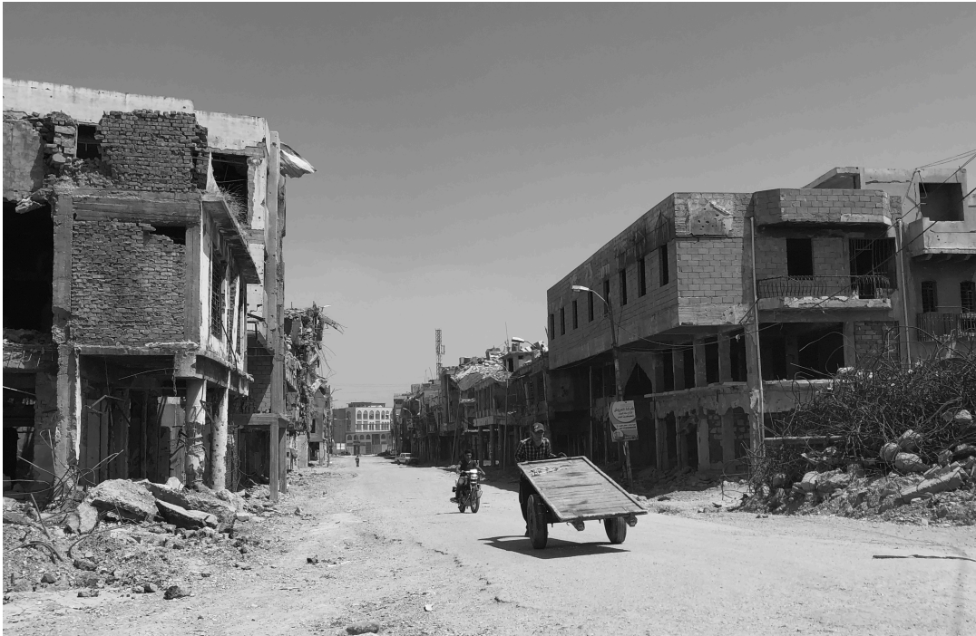
West Mosul, June 2019

Understanding the root causes of citizens' dissatisfaction with government is no simple matter. In part, the analytical challenge stems from the fact that the very terms we use to diagnose the causes of Iraq's governmental chaos are too abstract and general to shed meaningful light on the situation. 'Corruption,' 'state capture' and the 'quota-based system' ( muhassasab ) are some of the most commonly mentioned sources of government dysfunction and corresponding citizen distrust; however, rarely do we see a sufficiently detailed explanation of what is concretely meant by these terms, and how they function in specific contexts.