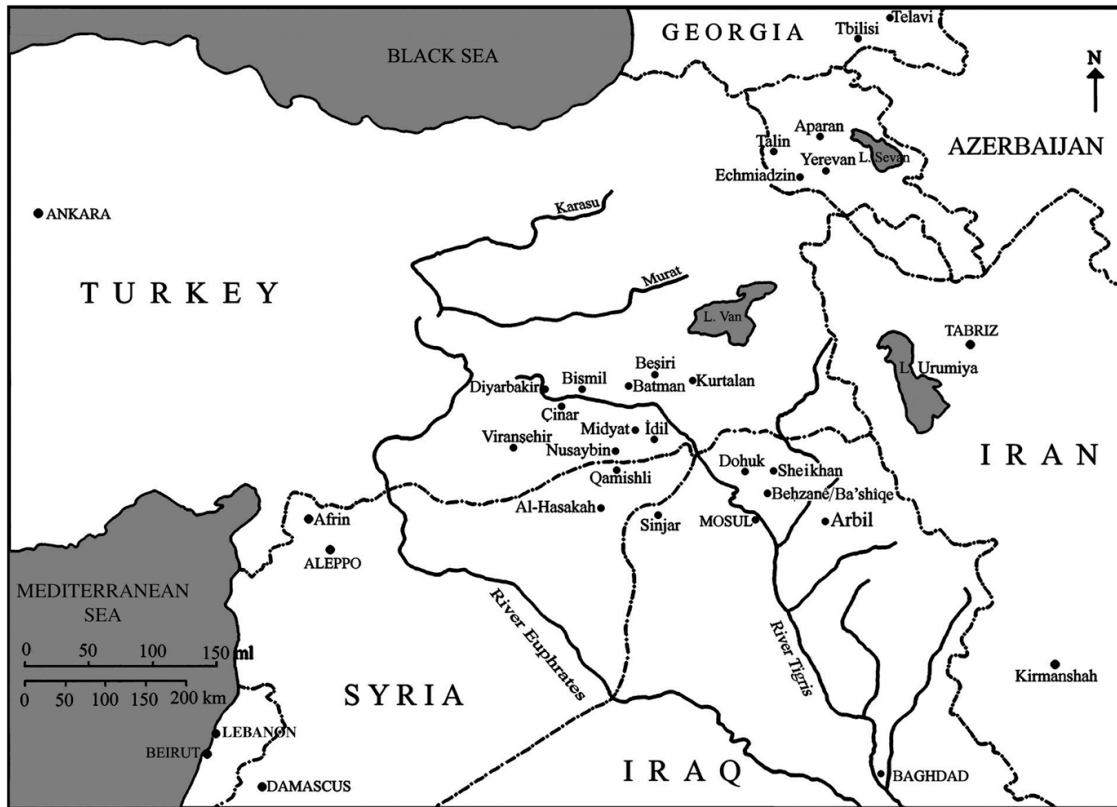
Map 2. Cities where Yazidis are present in the Middle East.