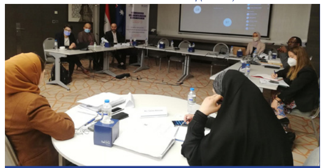
Figure 4: C4JR representatives participated in an IOM facilitated workshop with Iraqi MPs on developing the final draft of the Yazidi Survivors Law