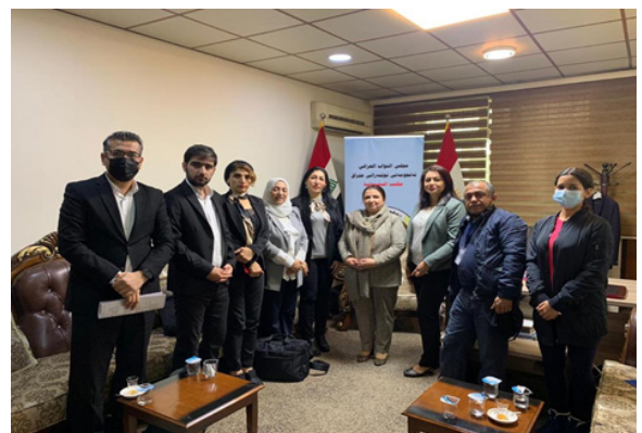
Figure 2: C4JR meet MP Saib Khidir.