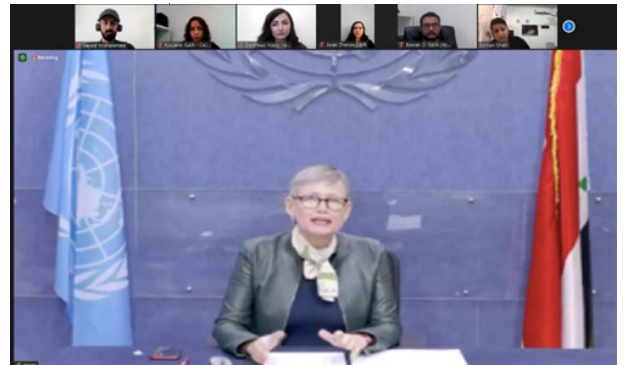
Figure 3: C4JR organized a virtual conference with the United Nations Assistance Mission for Iraq (UNAMI)

On December 8th 2020, C4JR organized a virtual conference with the United Nations Assistance Mission for Iraq (UNAMI). In addition to MPs, officials from the Iraqi executive branch participated in the conference.