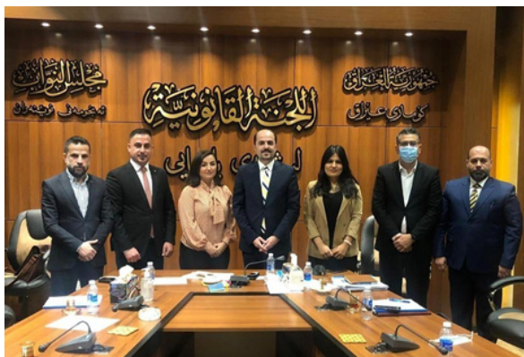
Figure 1: C4JR organized a virtual briefing for several Iraqi MPs.