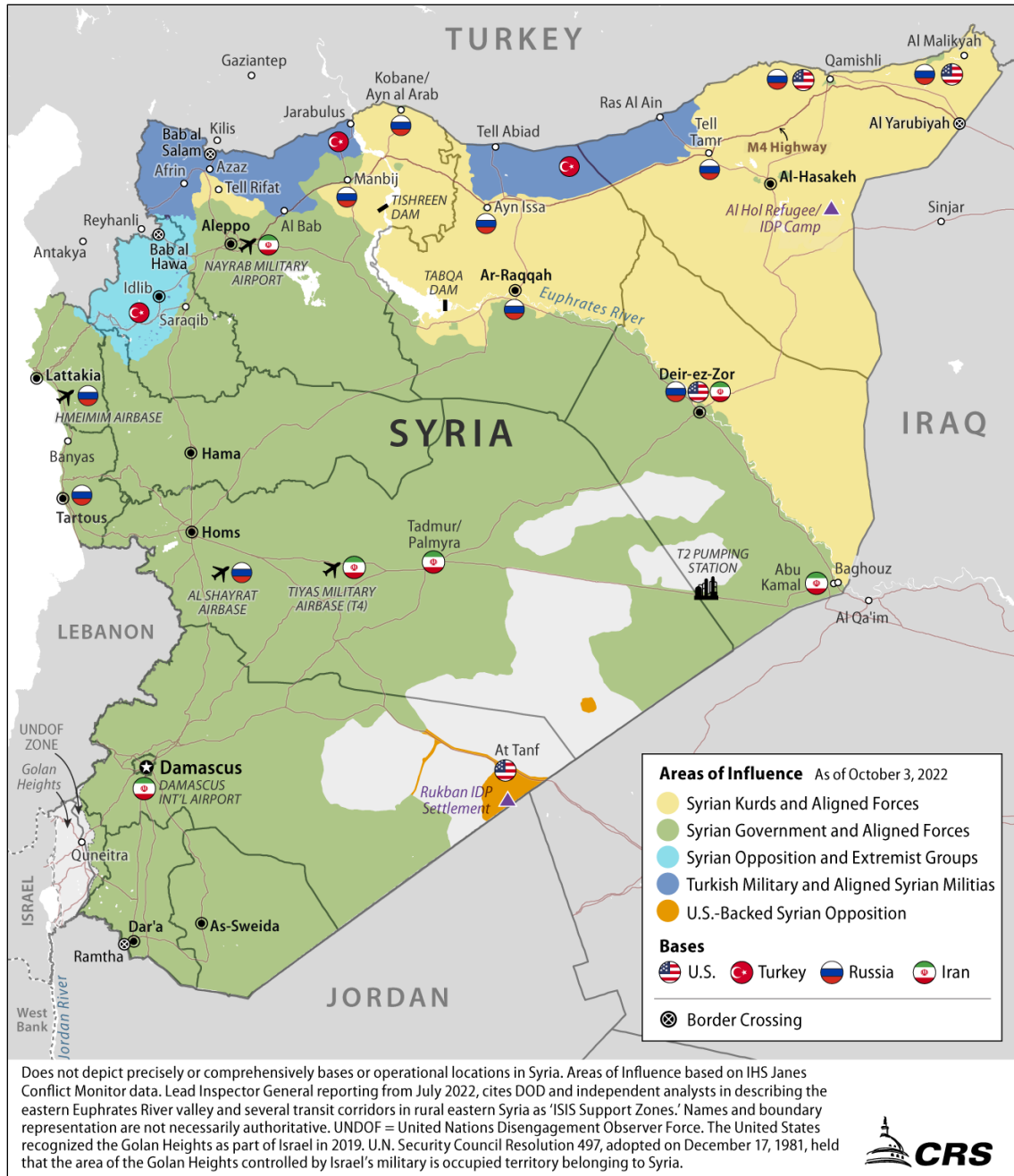
Figure 1. Areas of Influence

Source: Created by CRS using area of influence data from IHS Conflict Monitor, last revised October 3, 2022. All areas of influence approximate and subject to change. Base information from “The Operating Environment in Syria,” in Lead Inspector General for Operation Inherent Resolve | Quarterly Report to the United States Congress | April 1, 2022-June 30, 2022, p. 55, and press reports.