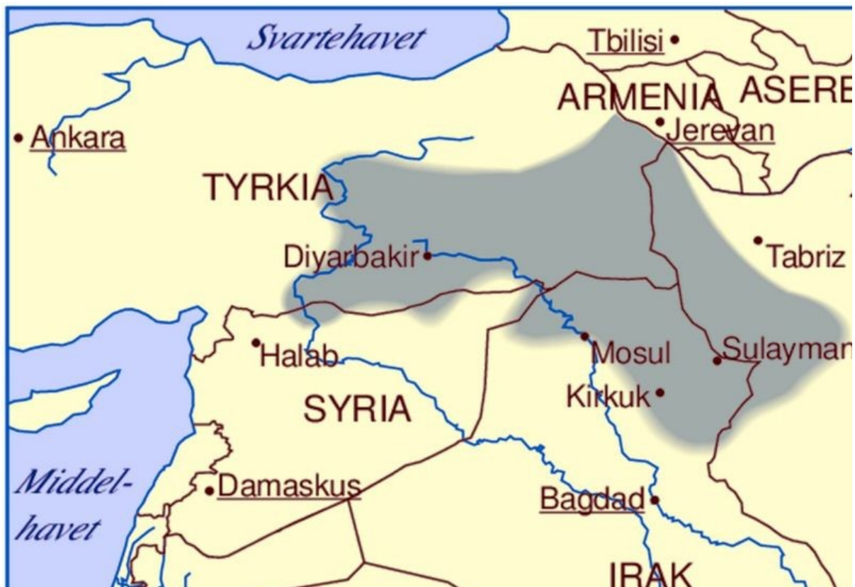
Kurdistan: The area comprises 25–30 million Kurds and is situated as a buffer between east and west. Kurdistan has never been recognized as an independent state. Map: Store Norske Leksikon/Scanpix

the map. In the highlands, in the middle of the border areas of these countries, live up to 30 million Kurds who have never been granted an independent state. The large ethnic group has become a thorn in the side of the states in the area.