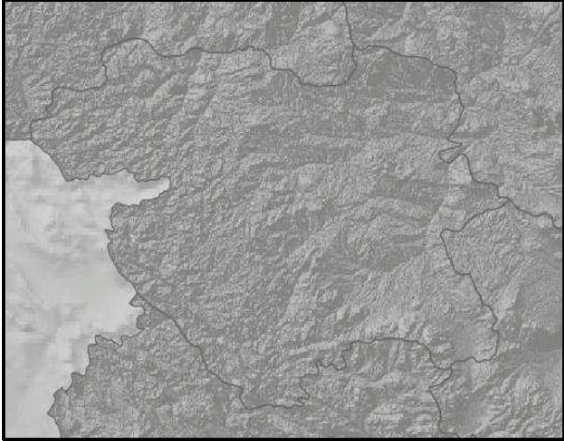
Figure 1: Background map for Kordestan Province (Map design: Robert Oikle, GCRC.)

Secondly, we brought together settlement-related geographic data (NCC 2016, Roostanet 2016) and open-access demographic data for all populated places of Kordestan from the 2011 census of Iran (ISC 2011), which was the most recent available census data at the time of research. However, because the geographic data has not been made publicly available in tabular format, members of the research team spent several hundred hours reconstructing georeferenced (GPS) coordinates for each settlement.