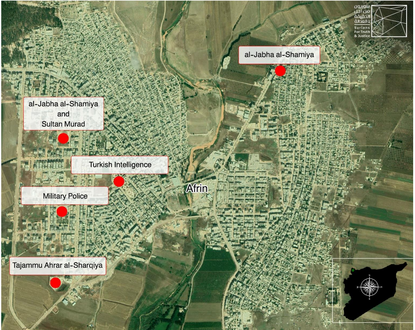
Image 1- A map locates the detention centers witnesses mentioned as in Afrin city.

The victims' inability to define the places they were held means that there are many more unofficial detention centers than those cited.