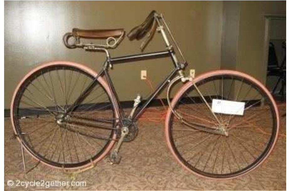
پاسکيله کهي فرانک لاینز