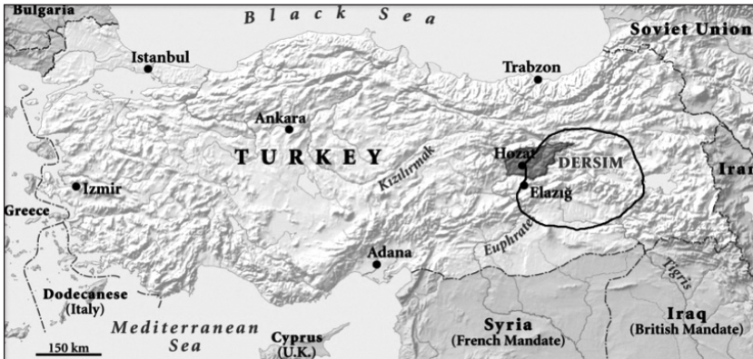
Approximate area encompassing the Sheikh Sa'id of Piran Rebellion