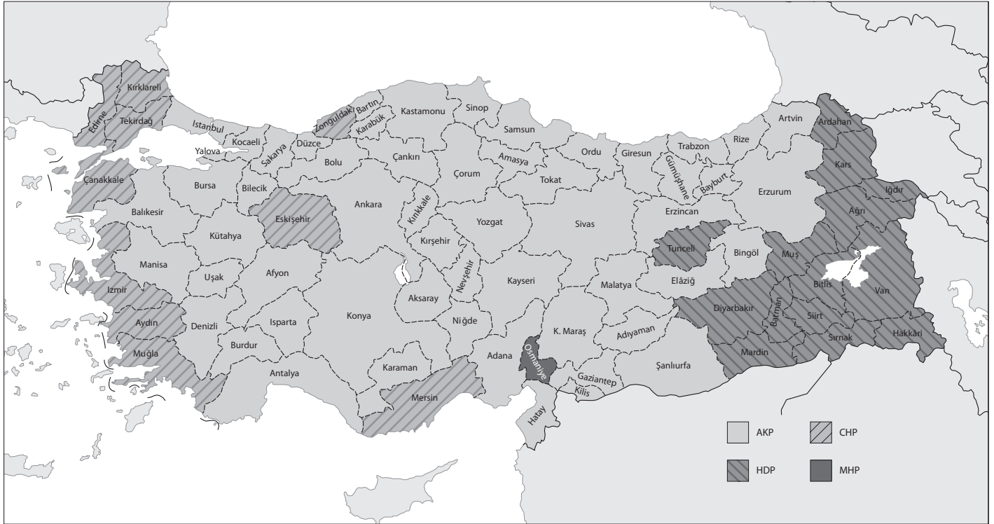
FIGURE 1 : Lead party by province, June 2015 election