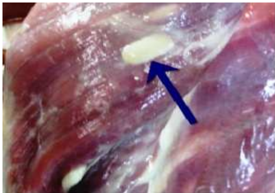
Fig 1. Macroscopic cyst in muscle of sheep.