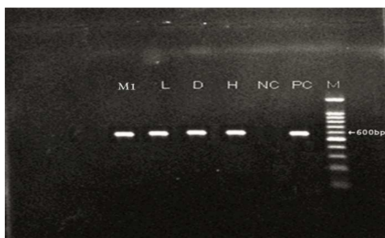
Fig 3. PCR Product from extracted DNA of Sarcocystis in different tissues. M: Molecular weight marker (100bp), PC: Positive Control, NC: Negative Control, H: Heart, D: Diaphragm, L: Liver, M1: Muscle.