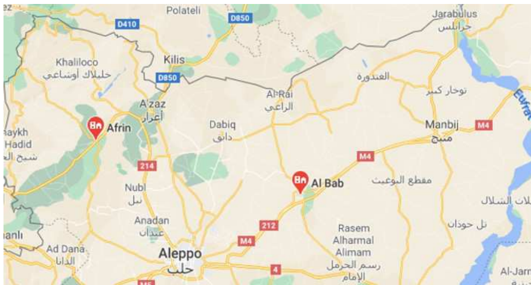
Figure 2: Northern Aleppo Governorate 19

In October, there were reports of clashes between non-state armed groups as well as targeted attacks on civilians and humanitarian workers in northwestern Syria in areas such as Afrin, A'zaz and Jarablus, Aleppo. 17 Many security incidents in Aleppo in 2020 occurred in the so-called 'conflict hotspots' 18 Afrin and al-Bab in northern Aleppo Governorate, as illustrated later on.