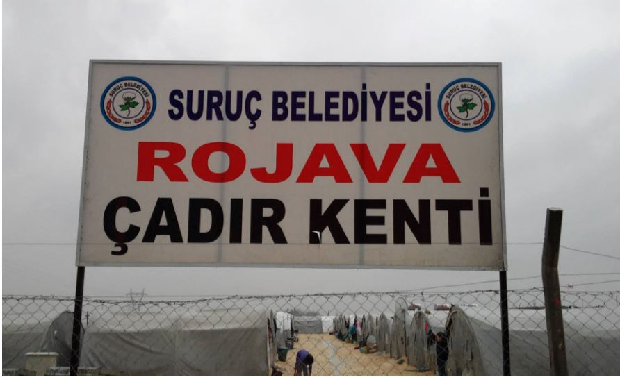
Figure 2. Signage to “Rojava” camp administered by the Suruç municipality

Such a satellite settlement of Rojava within the borders of the Turkish Republic emphasises the broader geographical nature of Kurdish identity, and substantiates subversive trans-border solidarity. Moreover, the administrative structure of elected community representation within the camp strongly resembles the “commune” governance system evolving in Kurdish-controlled territory of Rojava/Syria. Establishing the respective identities of the Kobani and Shehid [Martyr] Arin Mirkan camps (the latter named after a female fighter who carried out a suicide action against IS while defending the city) can be understood as willed acts of commemoration, symbolically compensating for losses incurred across the border, and continuing the trans-border dialectic of repression and resistance. 32 Indeed, these “out-of-place” names can present a point of embarrassment for Turkish officials when brought up in coordination meetings and, as mentioned earlier, were eventually replaced with numerical identification.