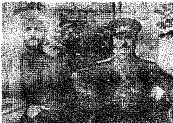
12 YEARS AGO Qazi Mehemed (left) President of the Kurdish Autonomous Republic of Mehabad was hanged by the Persian Government 12 years ago. On the right is Mustafa Barzani, commander of the armed forces of the Republic, who is now, once again, a 'soldier of the Republic', the Iraqi Republic

official holiday and will be more highly esteemed in the Republic: the Kurds have now a great standing in the Republic. All the Iraqi people, Arabs and Kurds, are solidly united behind their leader, Abdul-Karim Kassem.'