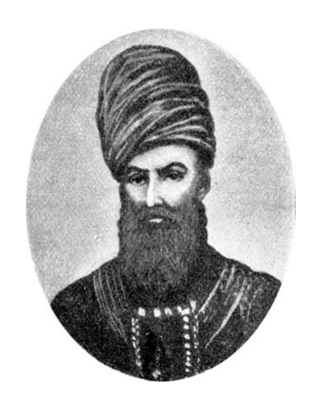
Image 2. Karim Khan Zand, one of great Kurdish Ameers<sup>558</sup> From Great Kurdish Figures: Shah Abd al Karim Khan Zand<sup>559</sup>

Similar to Saladin's, this portrait was not a part of any specific article either. Nevertheless, as an extensive type of multimodality it fit perfectly into the overall nationalist discourse of Rojî Kurd as the caption proudly announces the Kurdish identity of this historical figure.