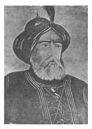
Image 1. 'O you the wonderful creation of this universe, don not think that the mother of time will bring a like of you into this world again. From exceptional Kurds: Sultan Saladin Ayyubid<sup>556</sup>

extensive as far as the multimodality of the text is concerned <sup>555</sup> because none of the images are part of an article in an immediate proximity. For instance, the first image was a portrait of Saladin (1137-1193), along with a caption, on the cover page of Rojî Kurd 's first issue: