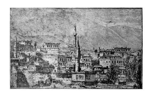
Image 3. Erzurum province, one of the fortified towns of Kurdistan<sup>560</sup>

Notice how the caption specifies the Kurdish identity of the city by significantly locating it in Kurdistan rather than portraying it as a city in the Ottoman Empire or the historical Armenia. This is a noteworthy discursive strategy especially when read in relation with KTTG 's discourse, in which almost all visual images were related to the Ottoman capital of Istanbul and thus were closely connected with the journal's Ottomanism.<sup>561</sup>