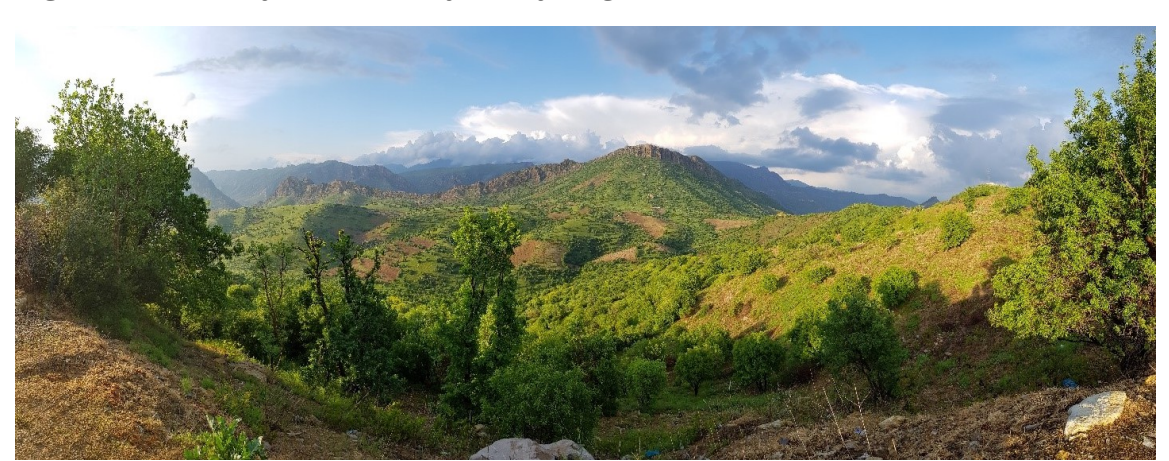
Figure 3. Countryside in Sulaymaniyah governorate

The climate of Iraqi Kurdistan is characterized by extreme conditions and follows two patterns: semiarid and mountainous. In the semiarid fringes, summertime temperatures can be as high as 95 degrees Fahrenheit, and in the mountainous regions during the winter, temperatures can be as low as -30 degrees Fahrenheit.<sup>35</sup> Operation Provide Comfort was conducted during the winter in northern Iraq, which is particularly harsh, given the cold and wet weather. Freezing temperatures made the plight of the Kurdish refugees even more dire, as many were ill-equipped to deal with the harsh winter climate in the mountains outside of their homes.