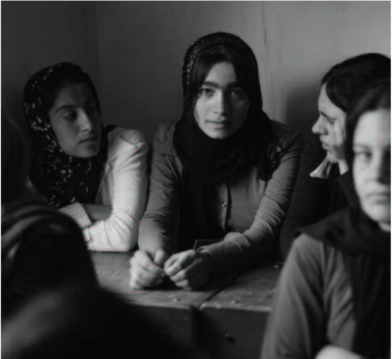
A young woman attends a seminar held by WADI.