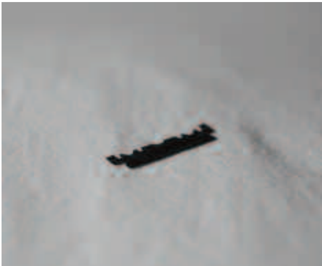
Girls are forcefully held down and their legs pried apart. The midwife cuts their clitoris with a razor blade, which often is unclean and unsterile.