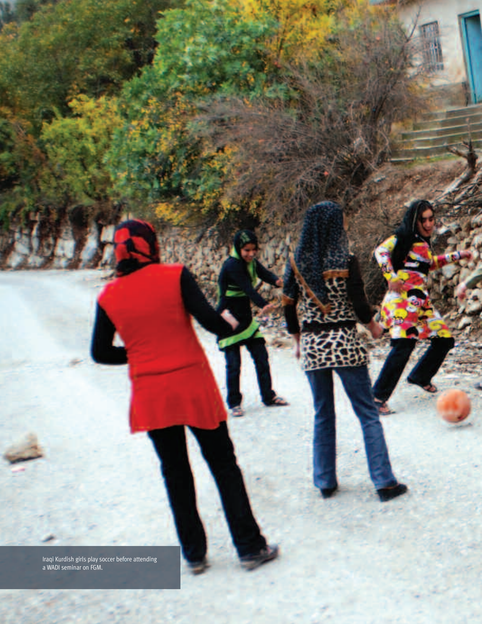
Iraqi Kurdish girls play soccer before attending a WADI seminar on FGM.